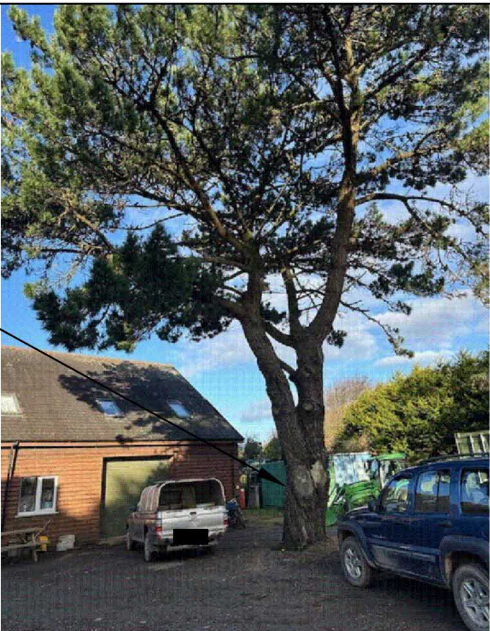
Photo 1. The tree showing the current use.