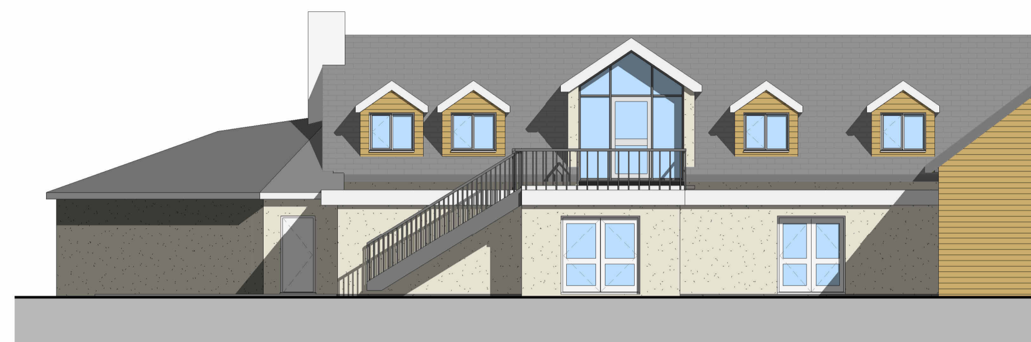
2 North 1 : 100