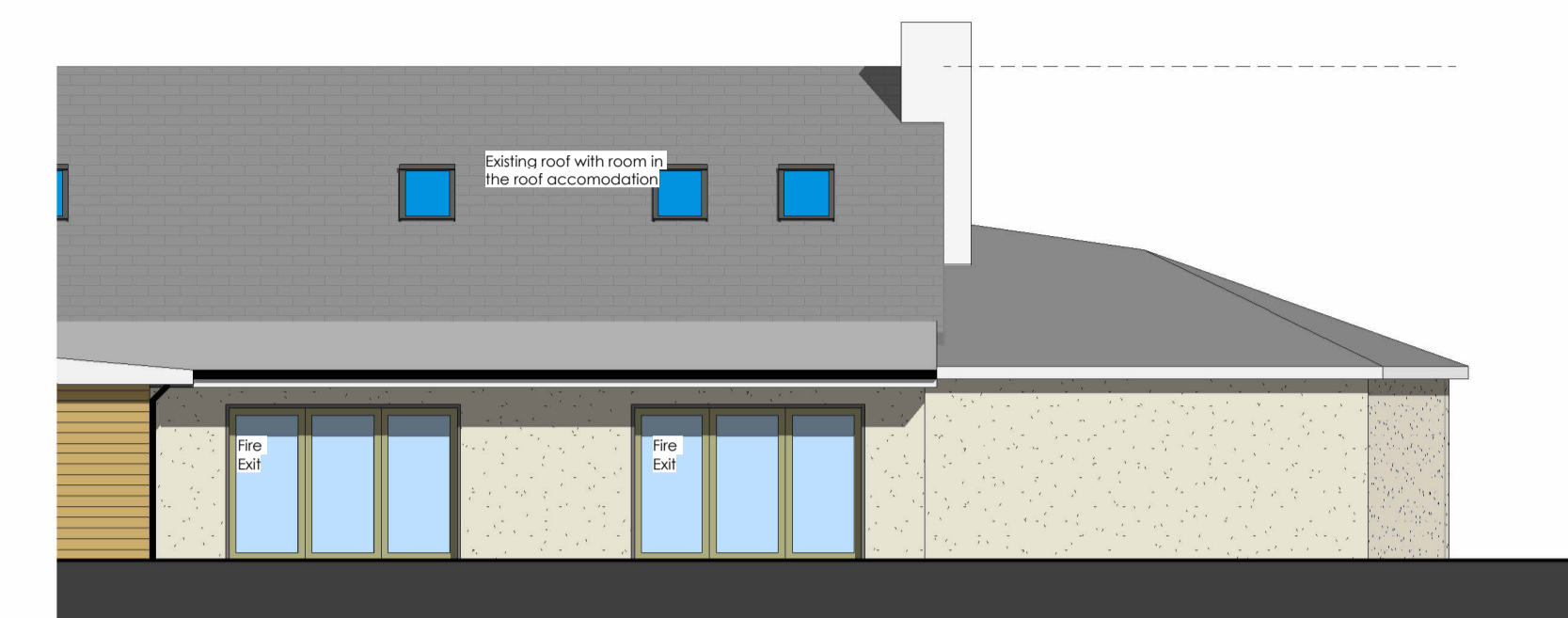
3 South 1 : 100