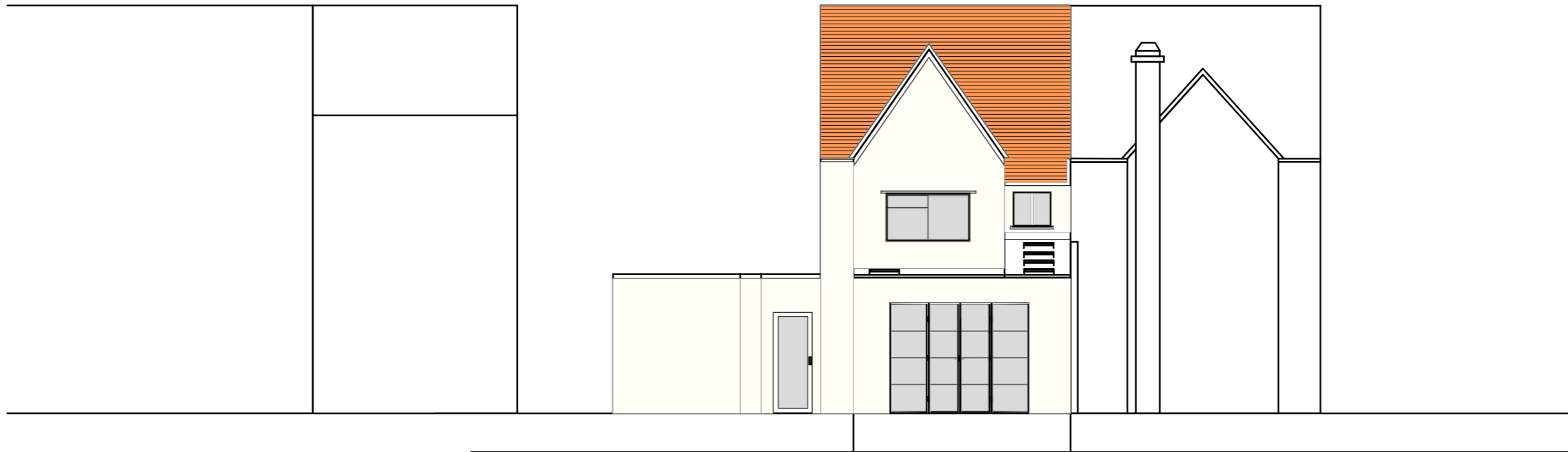
Existing rear (SW) elevation

All dimensions must be checked on site and not scaled from this drawing. If in doubt ask. Do not scale from this drawing. Check drawing on receipt and report any discrepancies to the Architect. Verify all dimensions/levels on site prior to construction. Sizes, depths and construction shown for foundations, floor slab and hardcore are the minimum for normal ground and should be adjusted to suit the conditions found when excavations have been made. The contractor will indemnify MRA against all claims, costs or damages which they might become legally obliged to pay in respect of any defects in the building which are adjudged to be due to workmanship or materials not being in accordance with the contract.