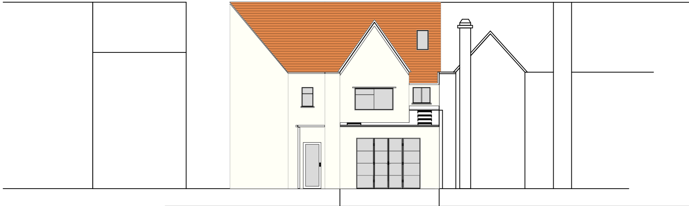
Proposed rear (SW) elevation

All dimensions must be checked on site and not scaled from this drawing. If in doubt ask. Do not scale from this drawing. Check drawing on receipt and report any discrepancies to the Architect. Verify all dimensions/levels on site prior to construction. Sizes, depths and construction shown for foundations, floor slab and hardcore are the minimum for normal ground and should be adjusted to suit the conditions found when excavations have been made. The contractor will indemnify MRA against all claims, costs or damages which they might become legally obliged to pay in respect of any defects in the building which are adjudged to be due to workmanship or materials not being in accordance with the contract.