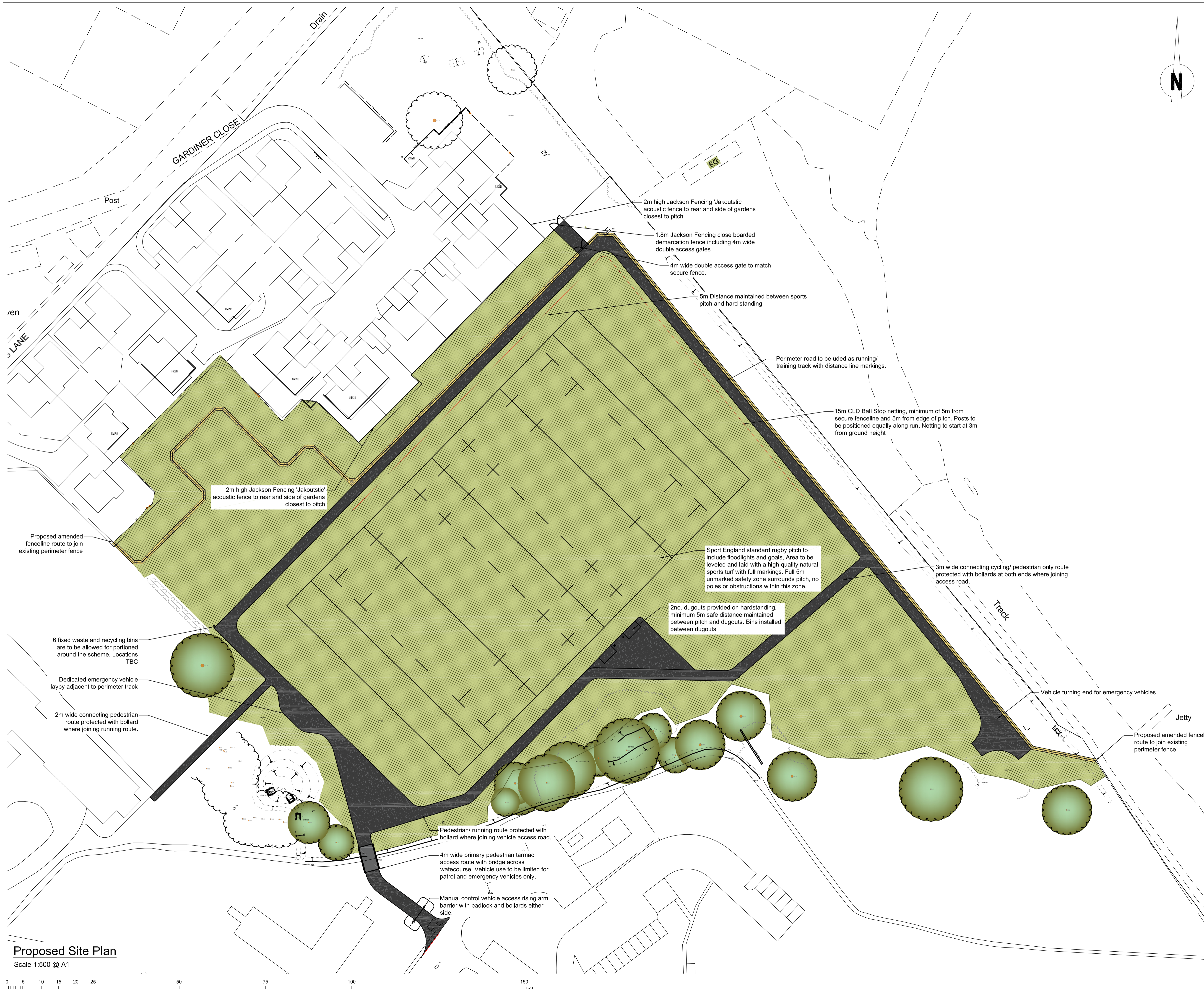
Proposed Site Plan Scale 1:500 @ A1