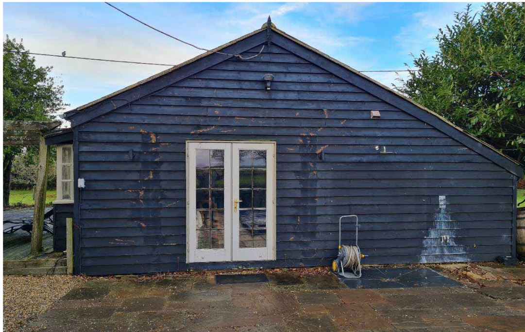
Fig.5 – South East Elevation of Existing Outbuilding.