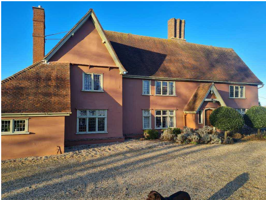
Fig.1 - Front Elevation of Wolfe Hall.

II House early C16, extended later C16. T-plan, lobby-entrance. 2 floors and attics. Timber-framed, rendered, with long-jettied upper floor at rear and jettied attic floor to cross-wing. Plaintiled roof, axial chimney with 3 attached elongated-hexagon flues. C20 casements. Single-storey C19 gabled entrance porch with arched and hood-moulded boarded entrance door. Main range has hall and parlour with chambers above. High quality timber framing; wind-braced close-studded walling, part of plank and muntin cross-passage screen, wind-braced clasped-purlin roof, windows with roll-moulded mullions exposed internally. Large open fire places with cambered lintels on re-used medieval roll-moulded limestone jambs in hall and parlour. Service end cross-wing c.1580; windows have ovolo-moulded mullions exposed internally; 3-centred arched doorways on 1st and attic floors. Listing NGR: TL7711962206