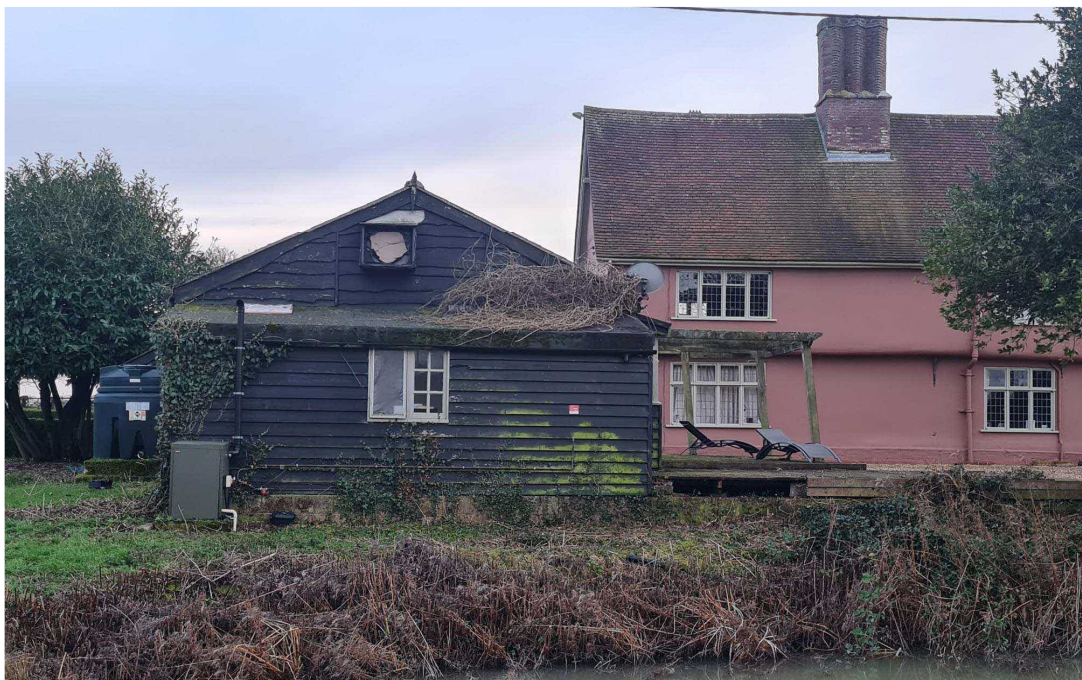
Fig.3 – North West Elevation of Existing Outbuilding showing Wolfe Hall Behind.