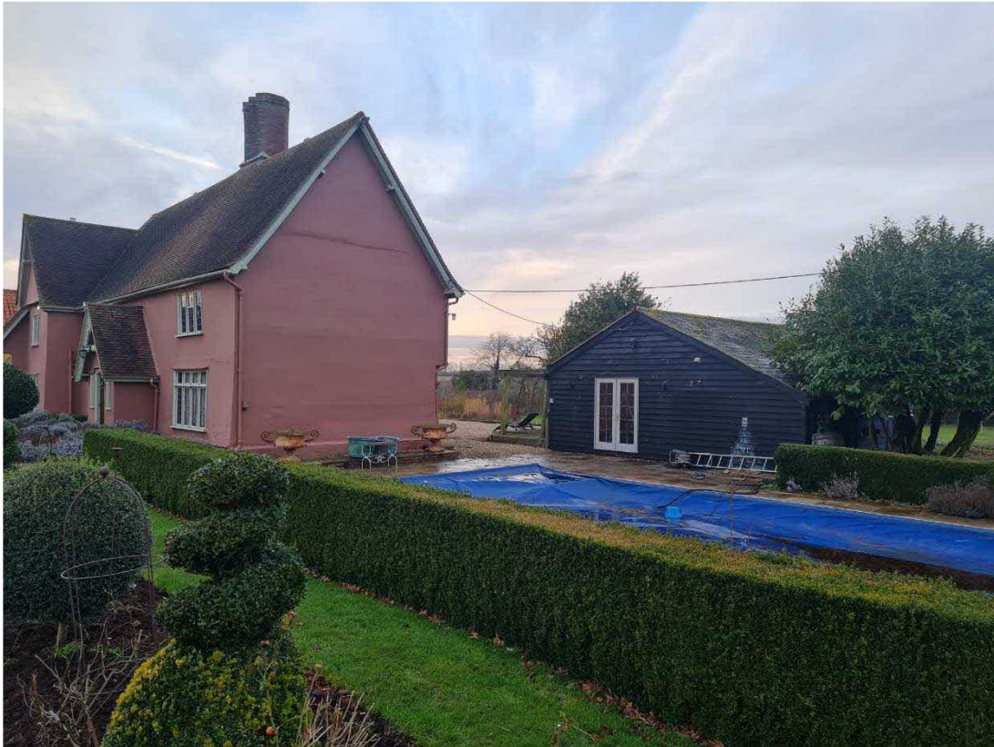
Fig.6 – South East Elevation of Existing Outbuilding showing building in context of Wolfe Hall.