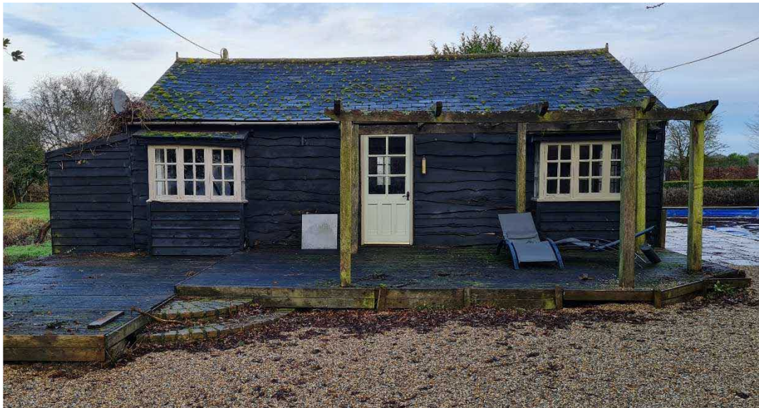
Fig.2 – South West Elevation of Existing Outbuilding.

Within Wolfe Hall's curtilage is a modern single storey, timber building formerly used as a commercial kitchen and now used as a pool house, junk store and pool plant room. The building is coming to the end of its life, is becoming unsightly and detracts from the attractive main building from both an architecturally aesthetic and contextual sense.