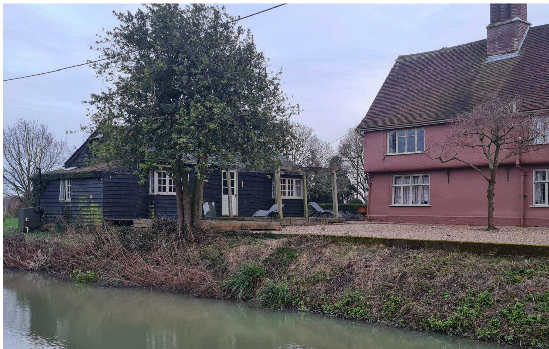
Fig.7 – South West Elevation of Existing Outbuilding showing building in context of Wolfe Hall.