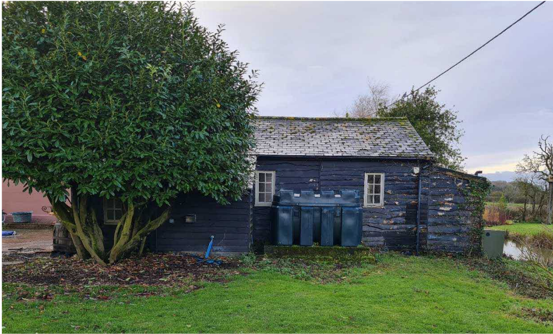
Fig.4 – North Eastt Elevation of Existing Outbuilding.