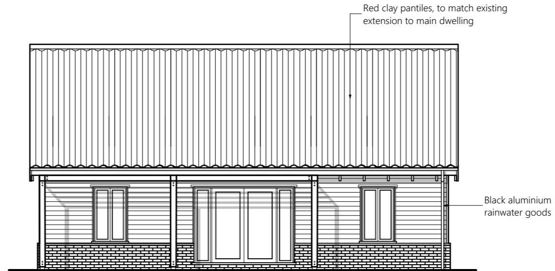
Proposed South East Elevation 1:100