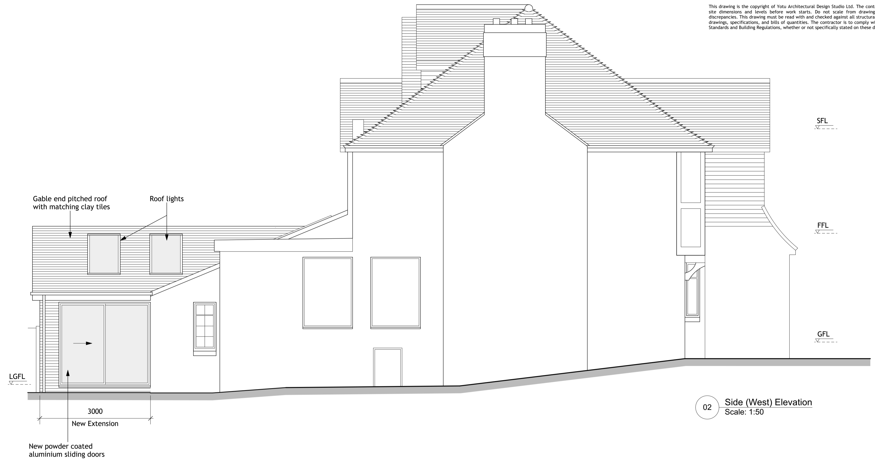
02 Side (West) Elevation Scale: 1:50