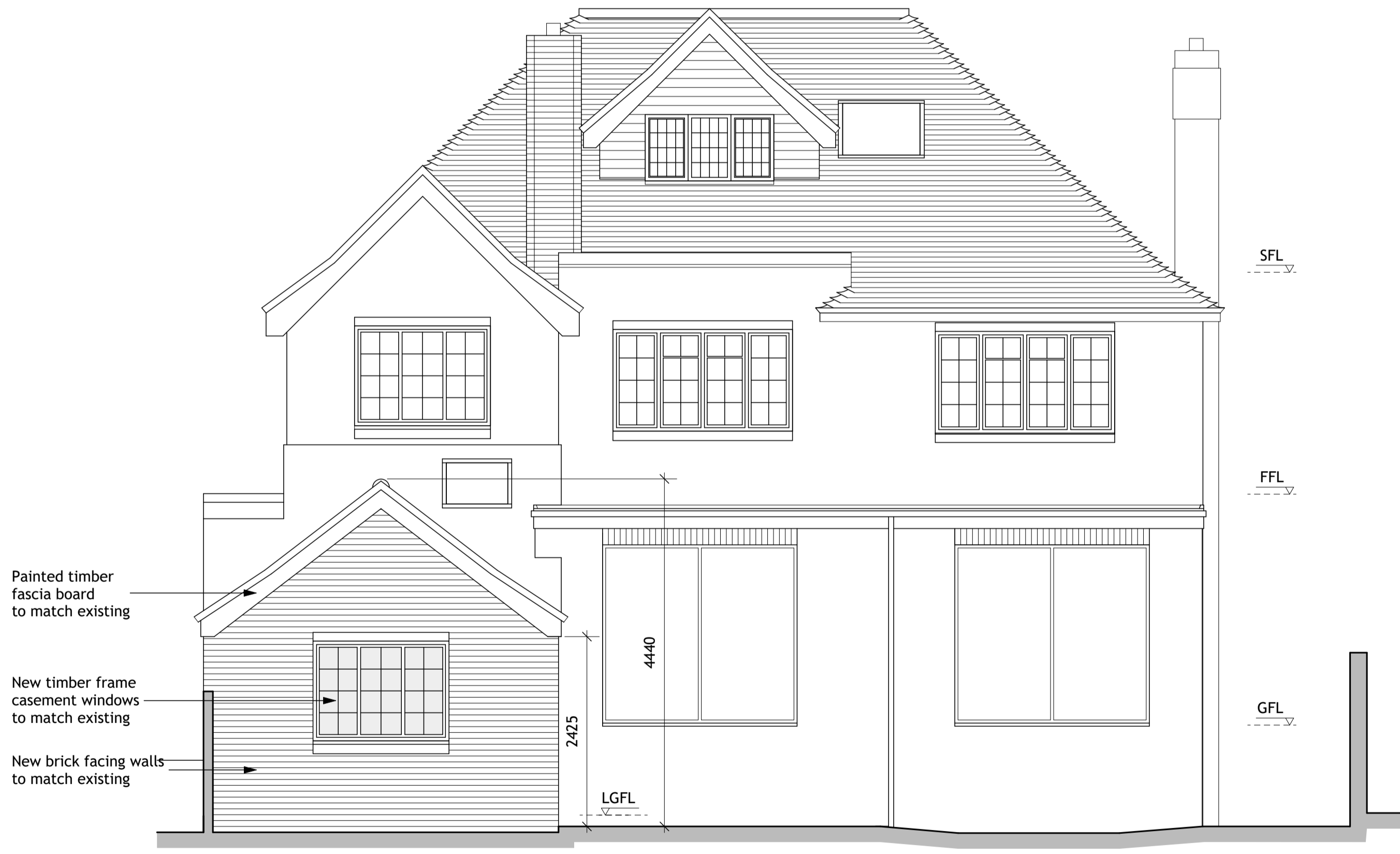
03 Rear Elevation Scale: 1:50