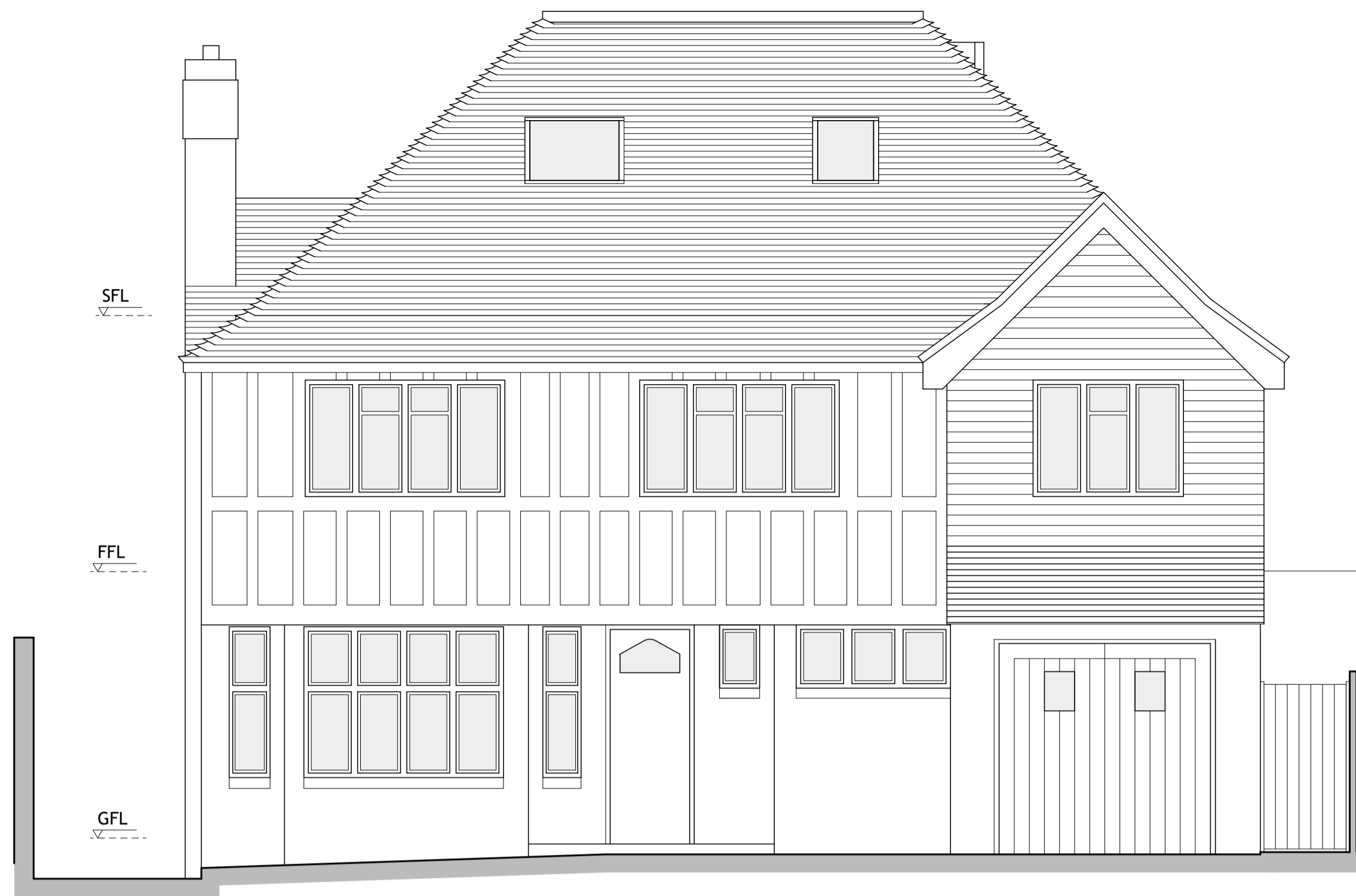
01 Front Elevation (No Changes Proposed) Scale: 1:50