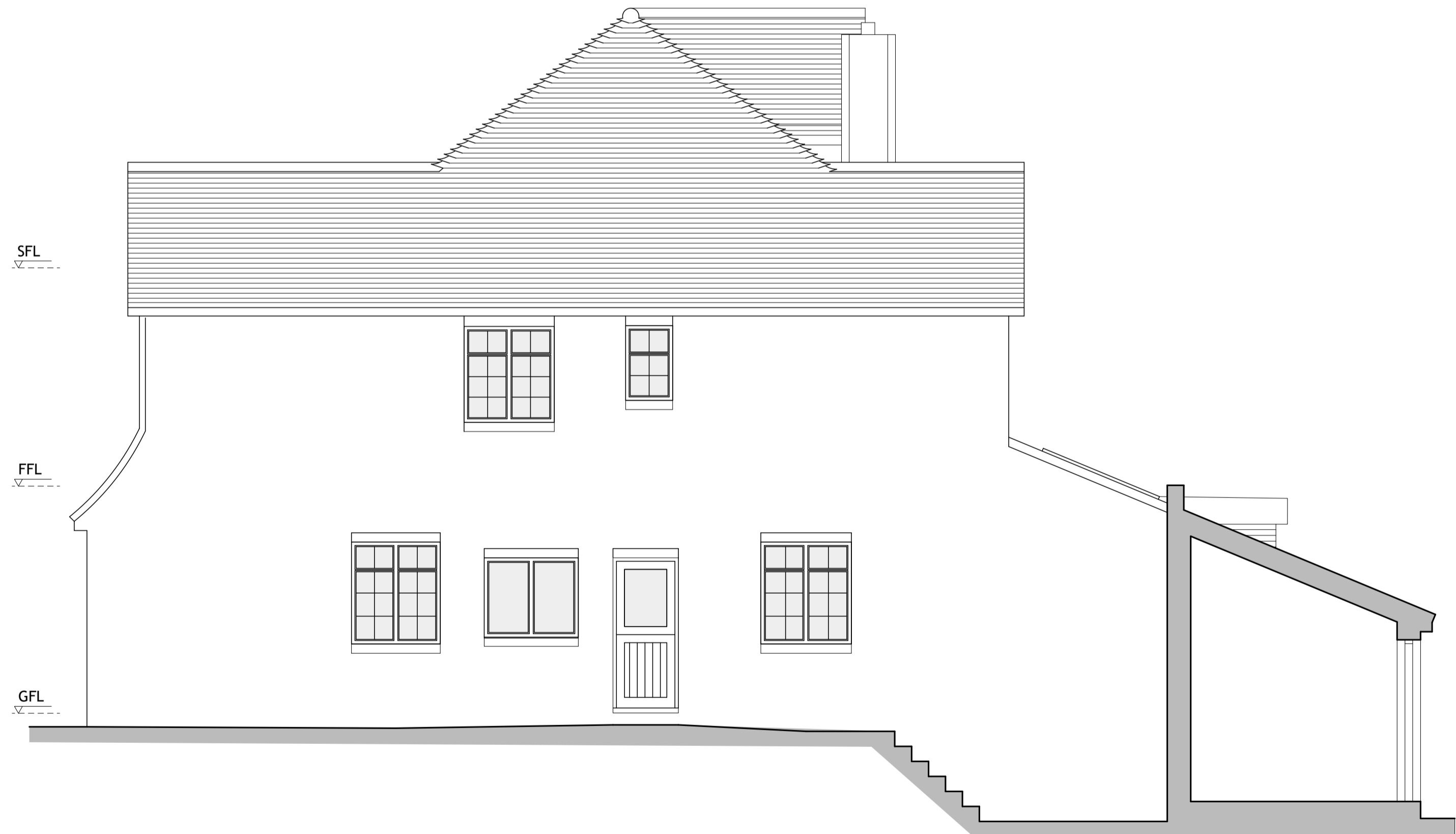
04 Side (East) Sectional Elevation Scale: 1:50