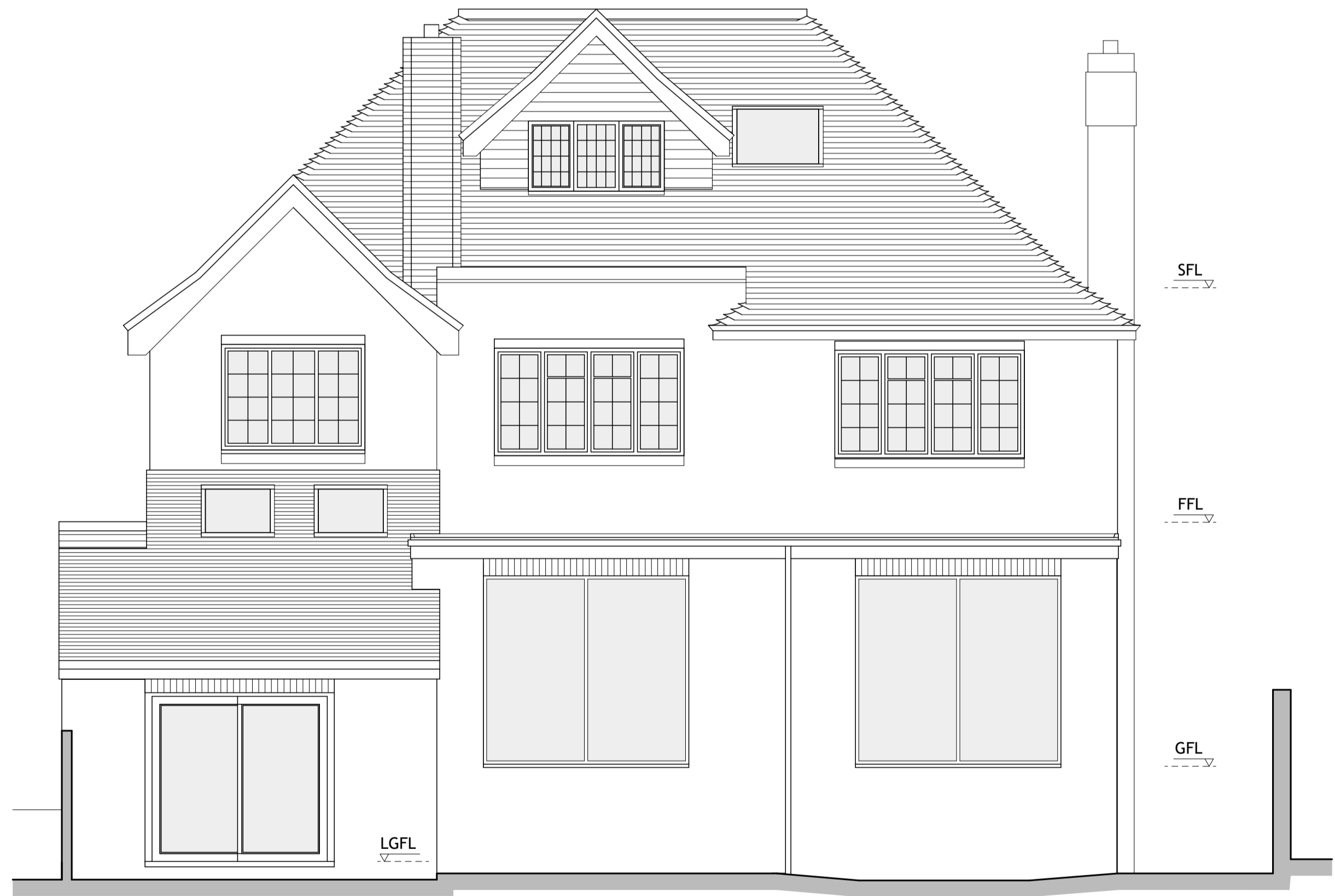
03 Rear Elevation Scale: 1:50