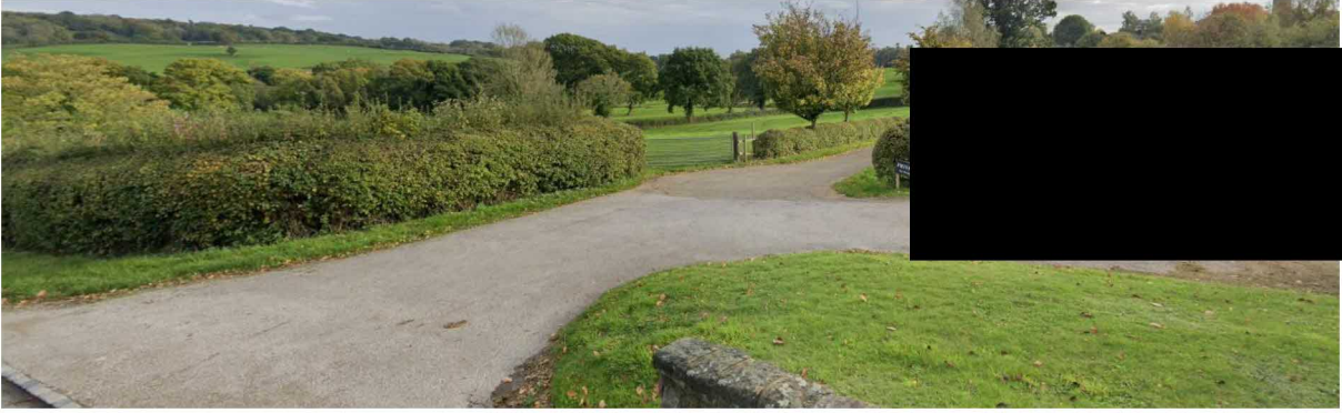
Photo 17 – Looking towards the site from A272 at entrance to car park adjacent to Petworth built up area.