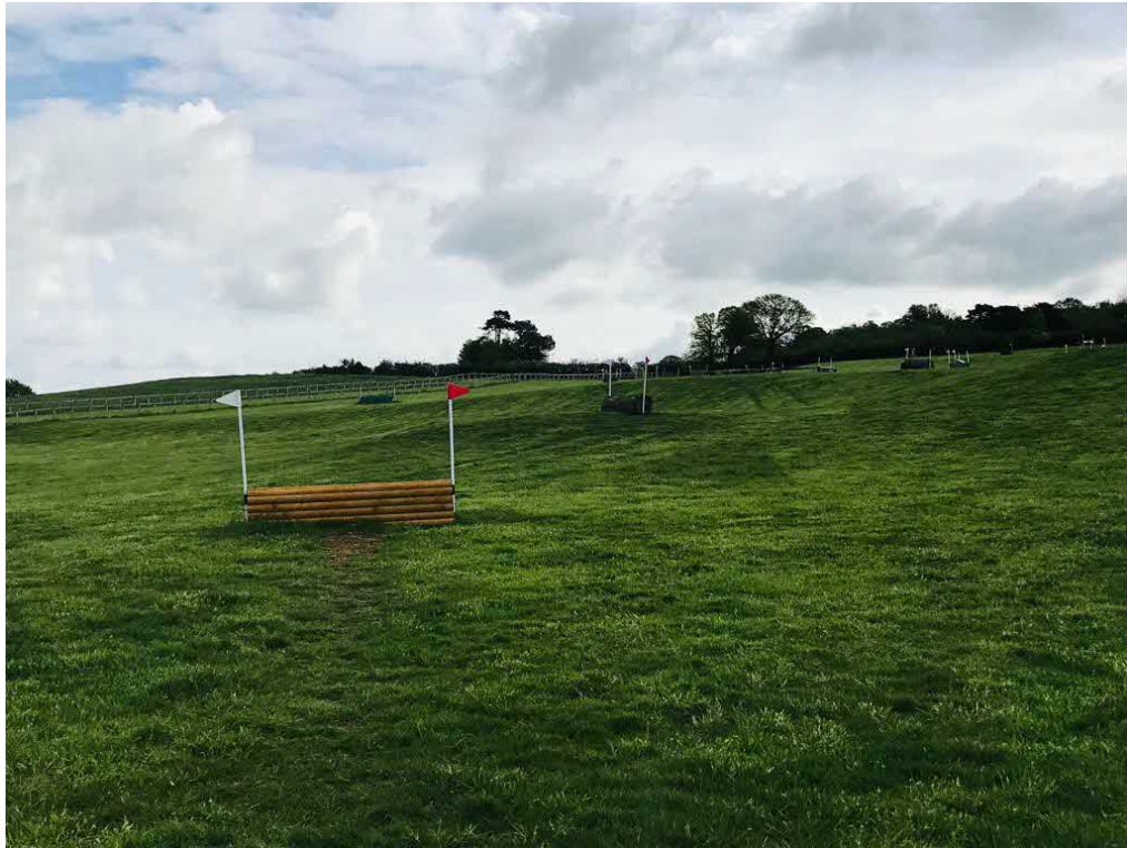
Photo 3 - Looking NE across the course