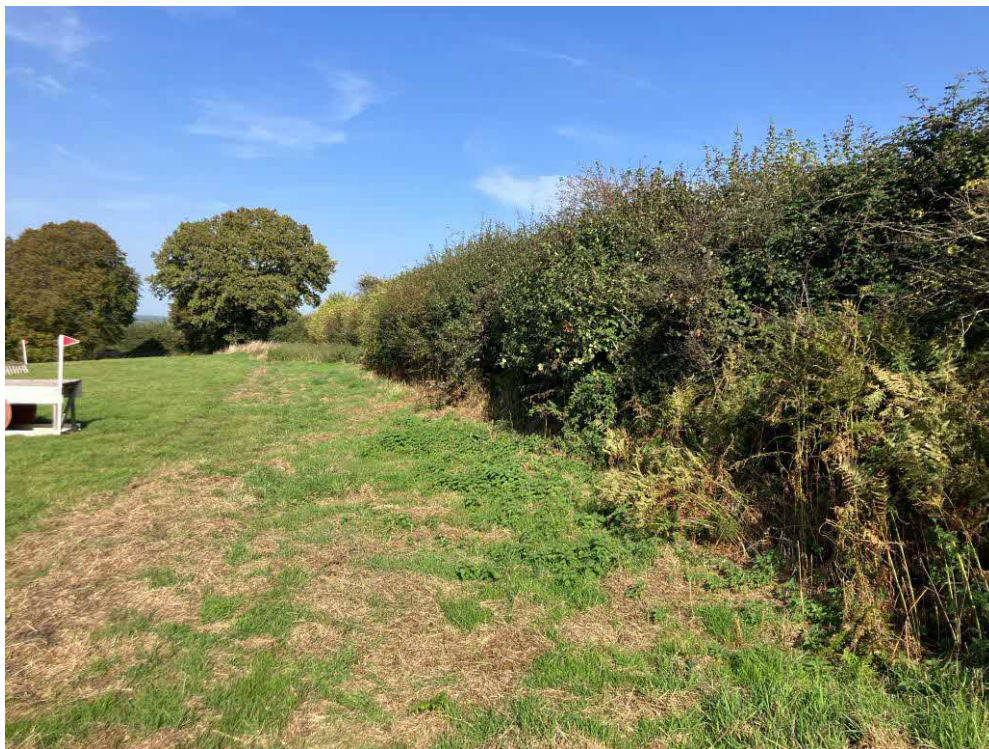
Photo 9C – Hedge along NE boundary of application site – Note hedge height and depth