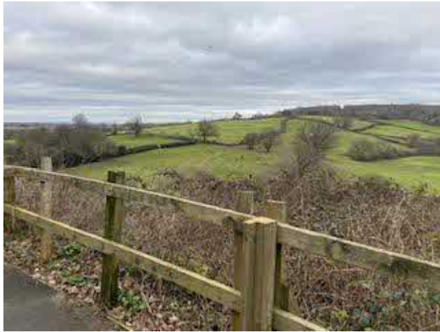
Photo 10 – From footpath along the western edge of the Shimmings looking towards the course