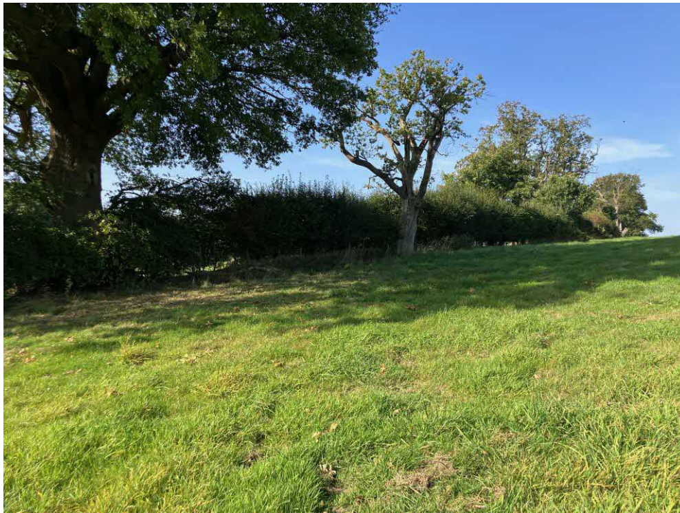
Photos 9D & E – Hedging along western boundary of application site. Please note hedge height and depth