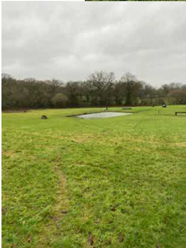
Photo 1 - looking towards the Shimmings from the course Photo 2 – older view of water jump