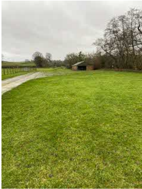
Photo 7 – Looking along access track towards the equine barn and parking area