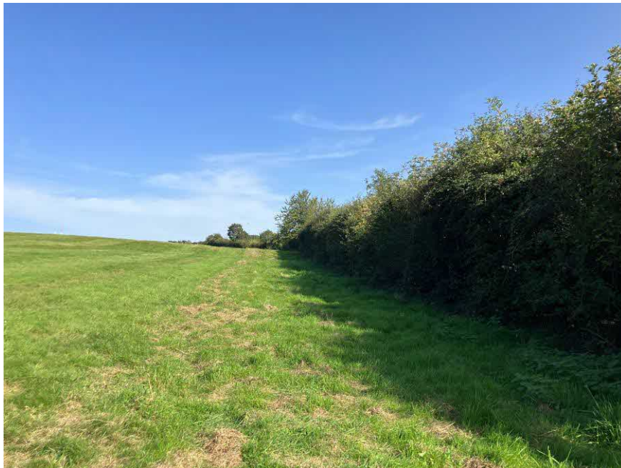
Photos 9D & 9E – Hedging along southern edge of the course. The footpath is on the other side of the hedge.