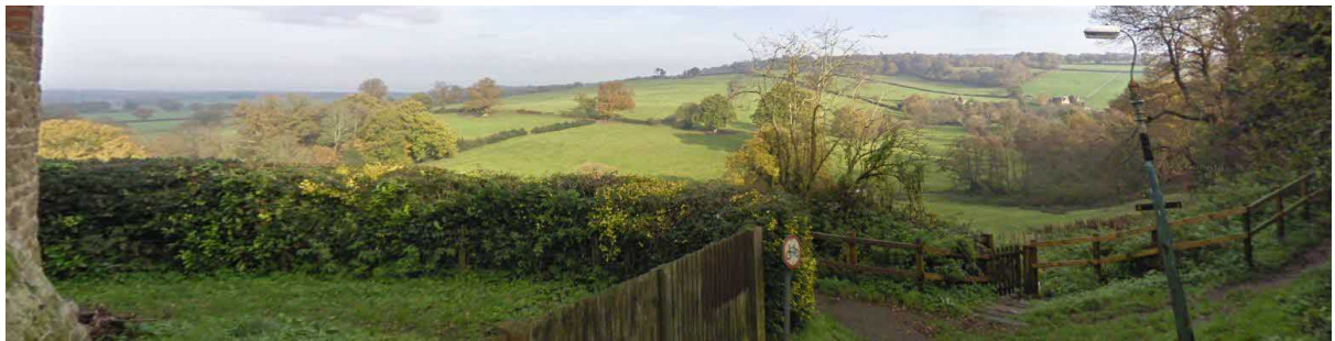
Photo 13 – From entrance to The Shimmings from path adjacent to the church