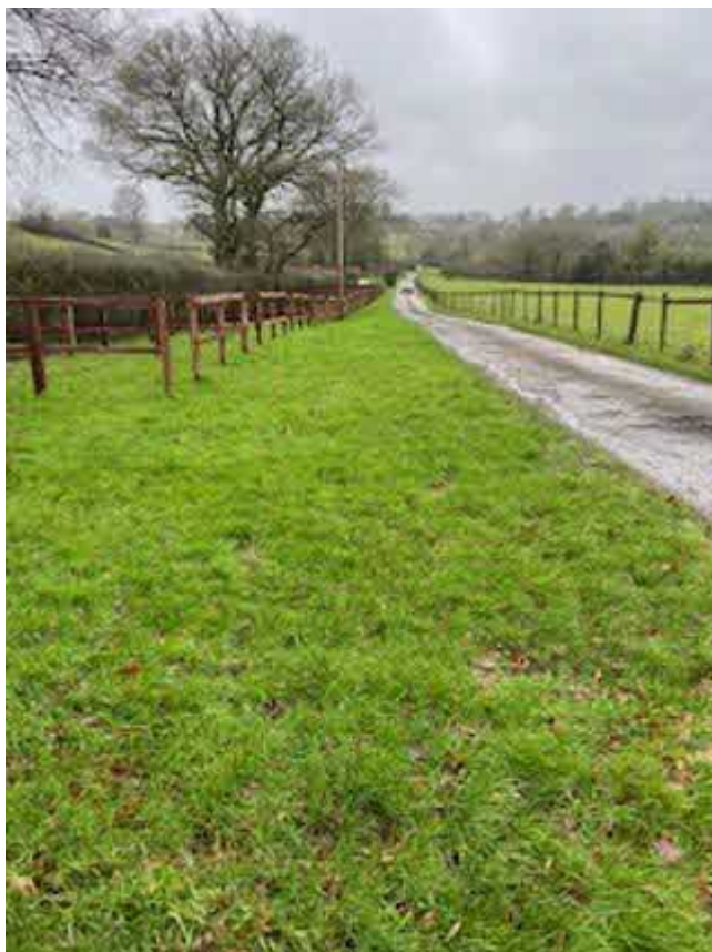
Photo 6 – Looking along the site access track with the horse/pony pens on the left