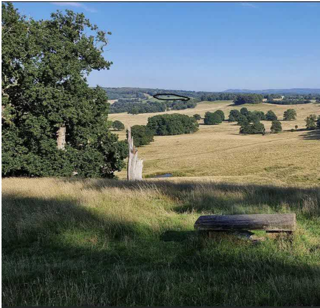
Photo 22 – From Monument Hill (Petworth Park) towards the course. (The course is circled in black)