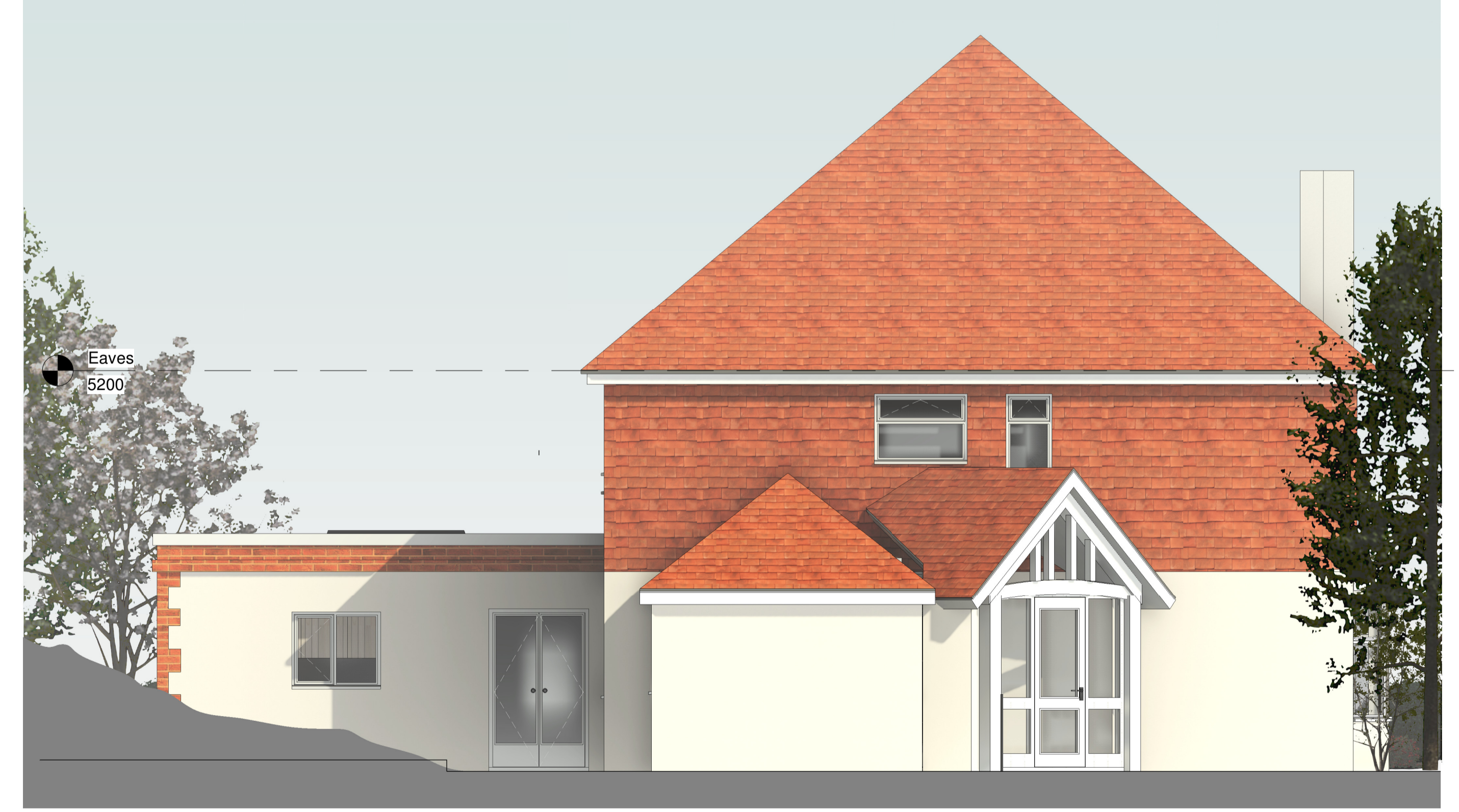
1 North-Proposed 1 : 50