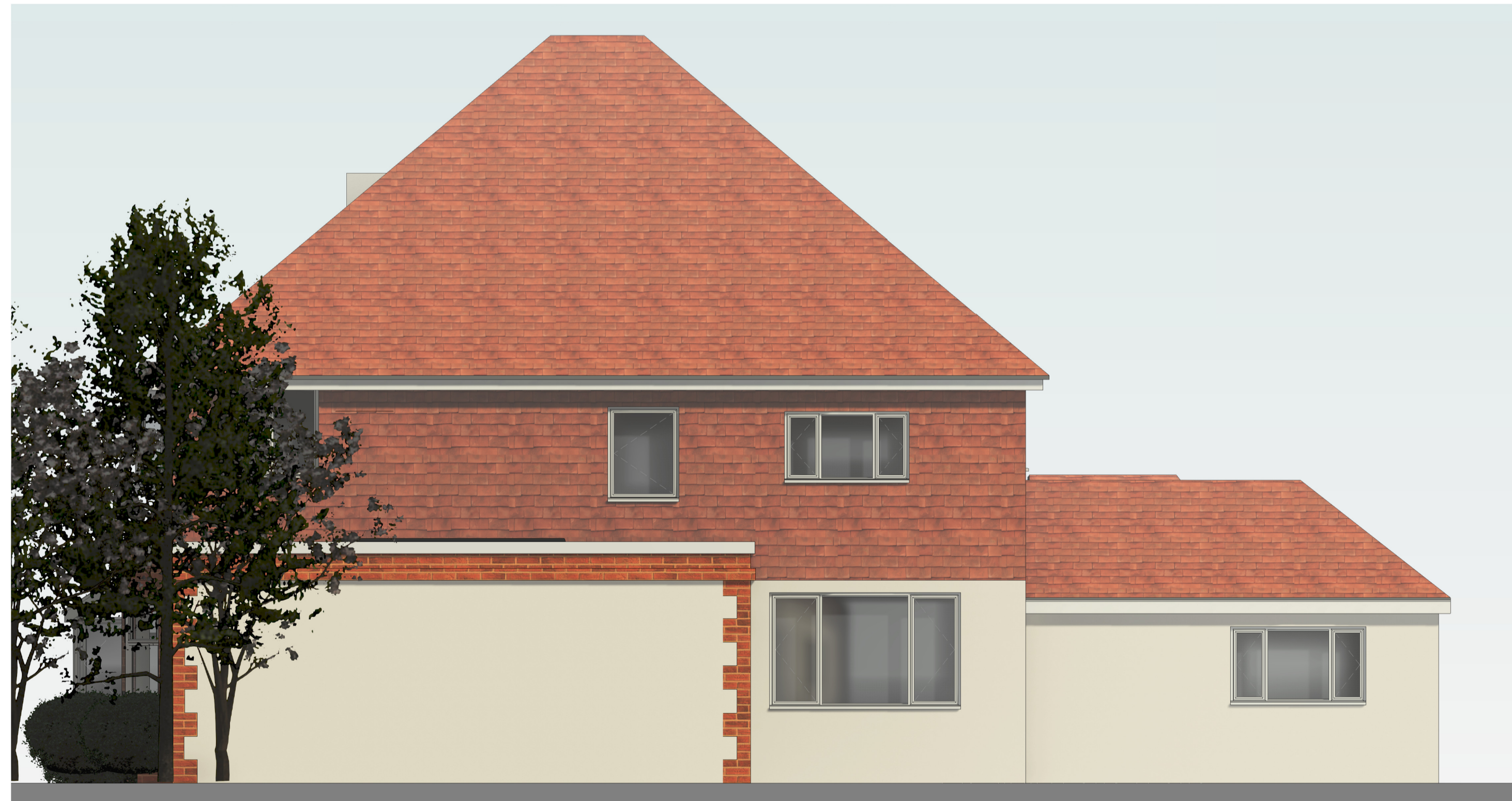
6 East-Proposed 1 : 50