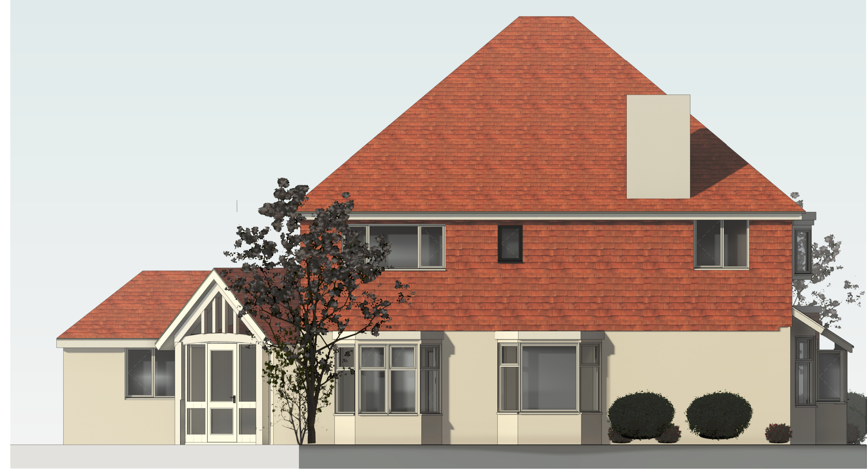
7 West-Proposed 1 : 50