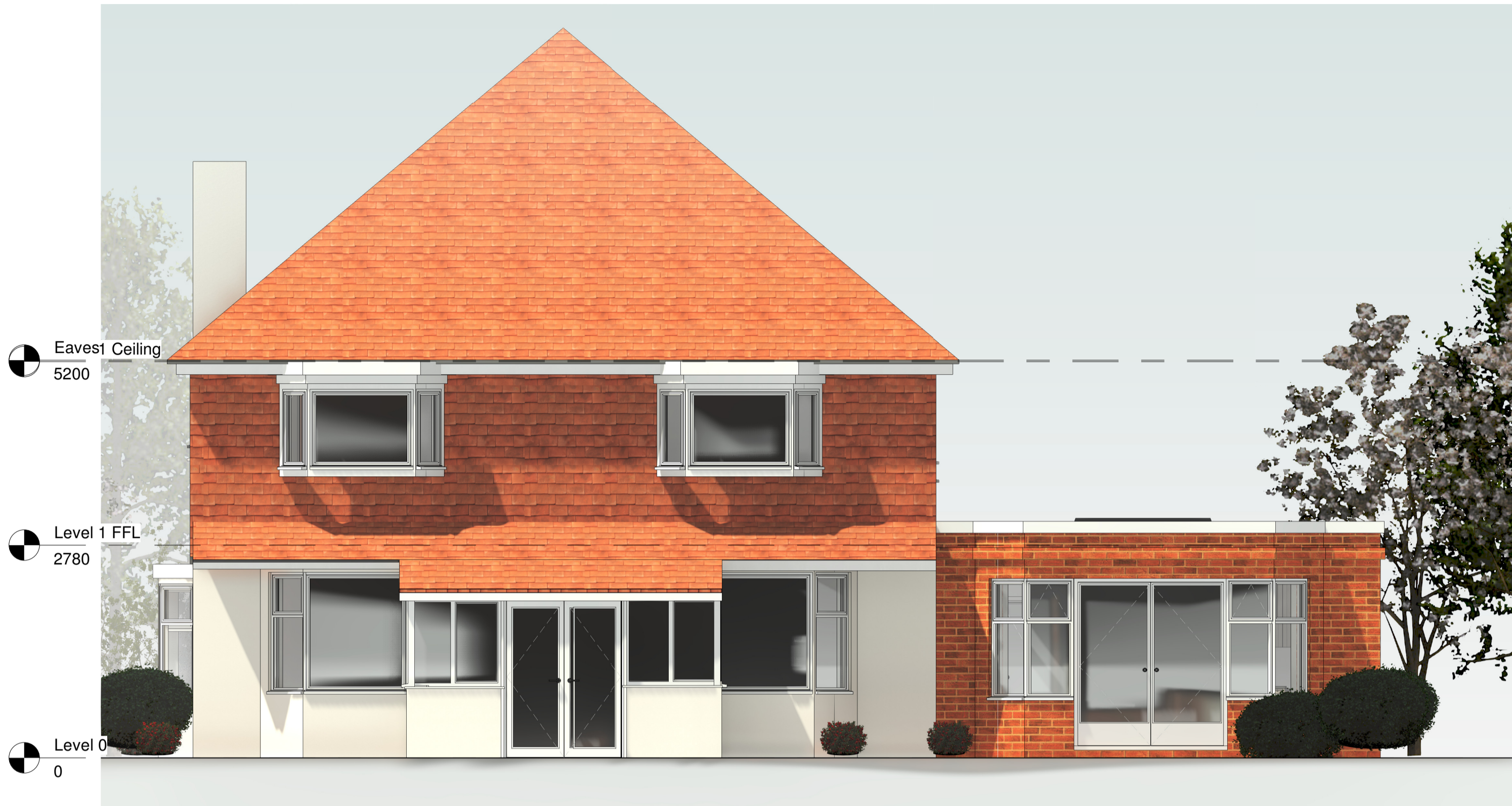
5 South-Proposed 1 : 50