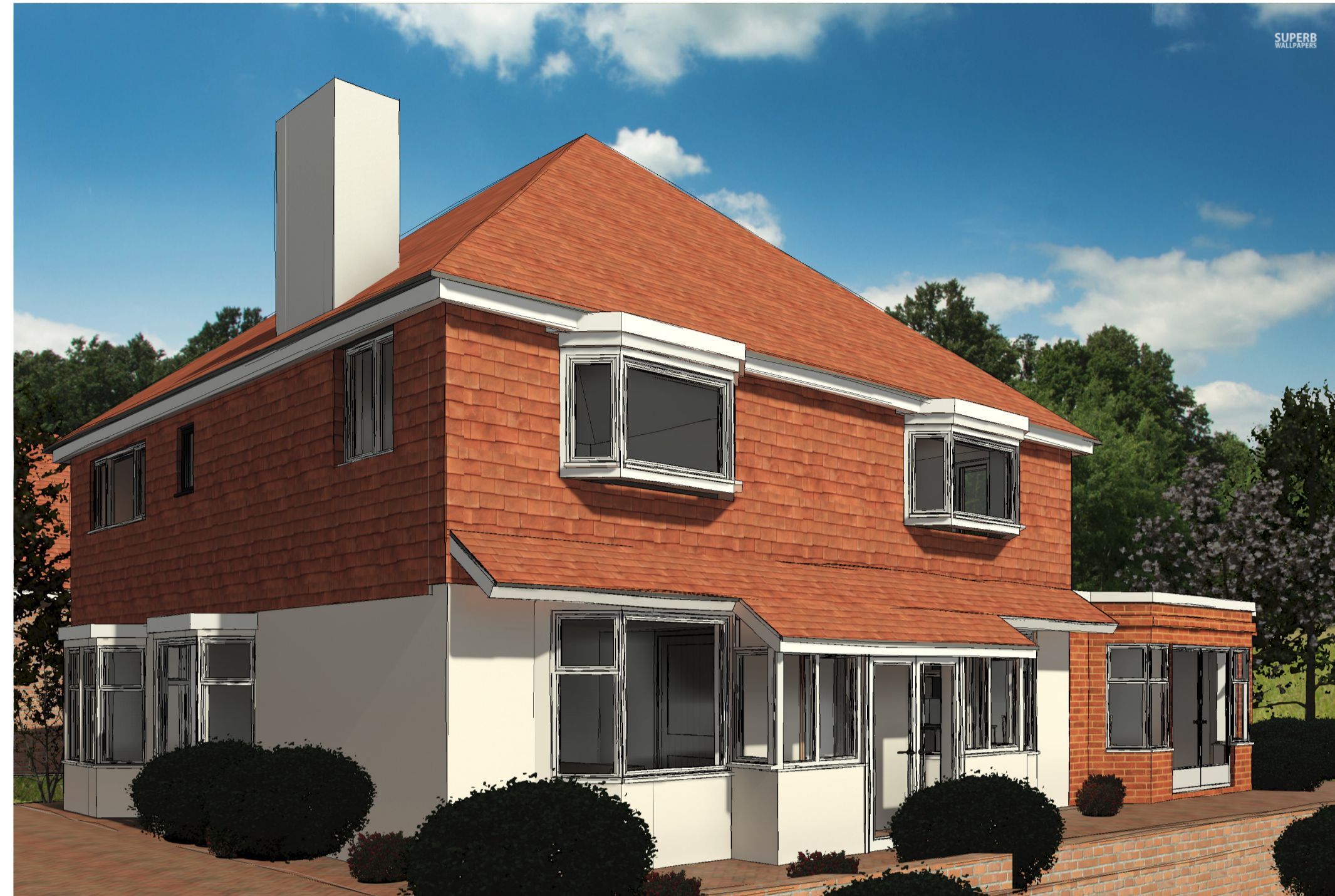
1 3D View 27