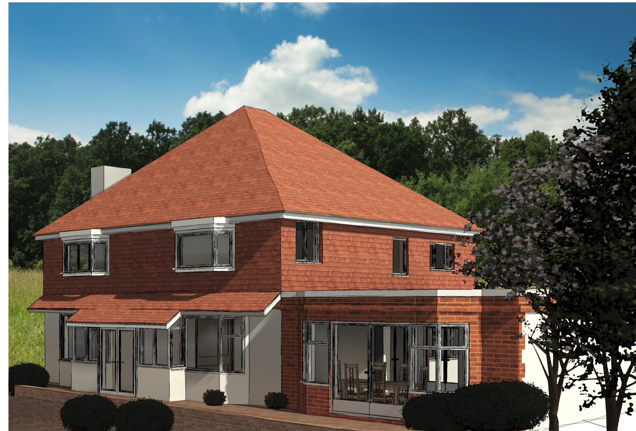
2 3D View 23