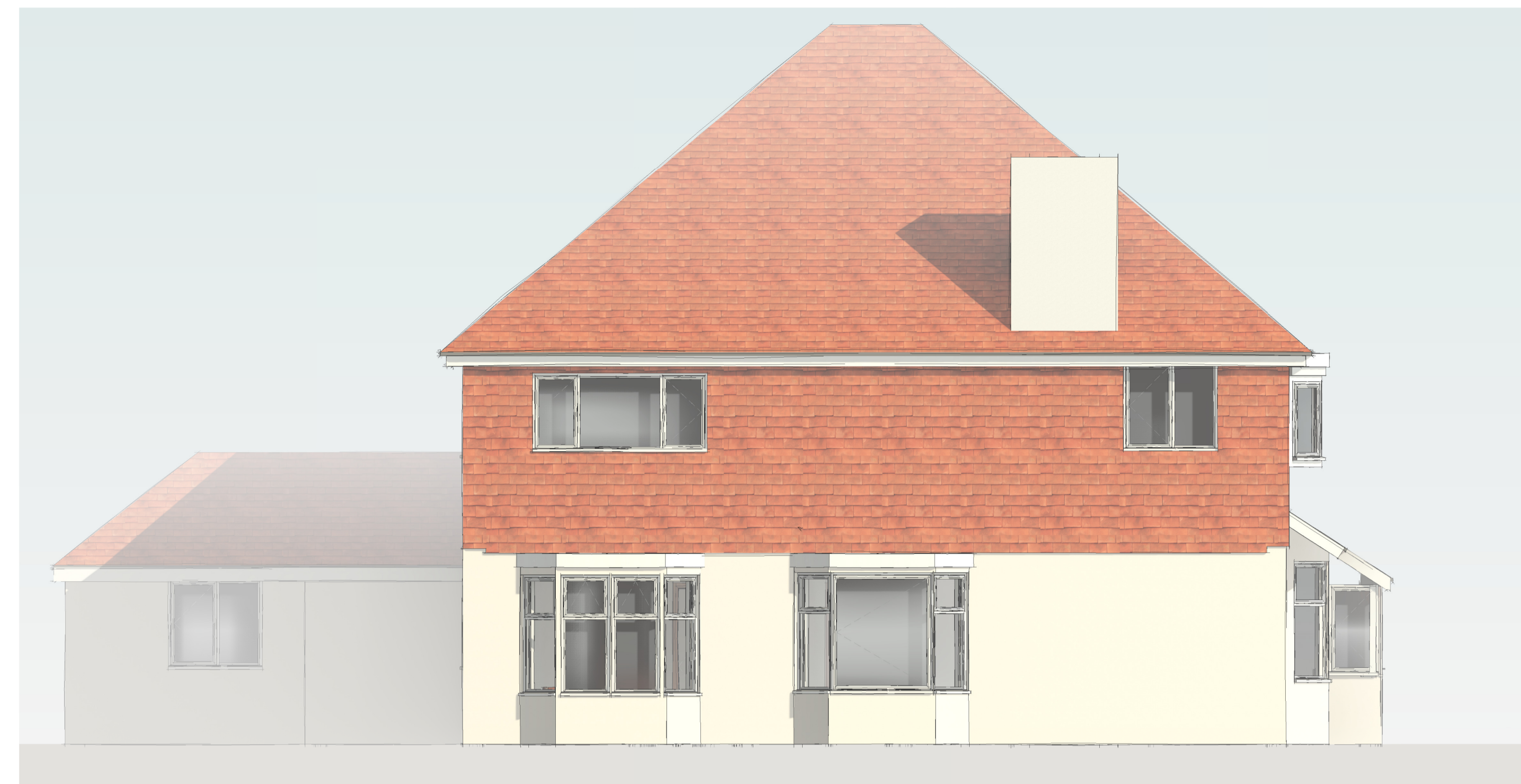
2 West.-Existing 1 : 50