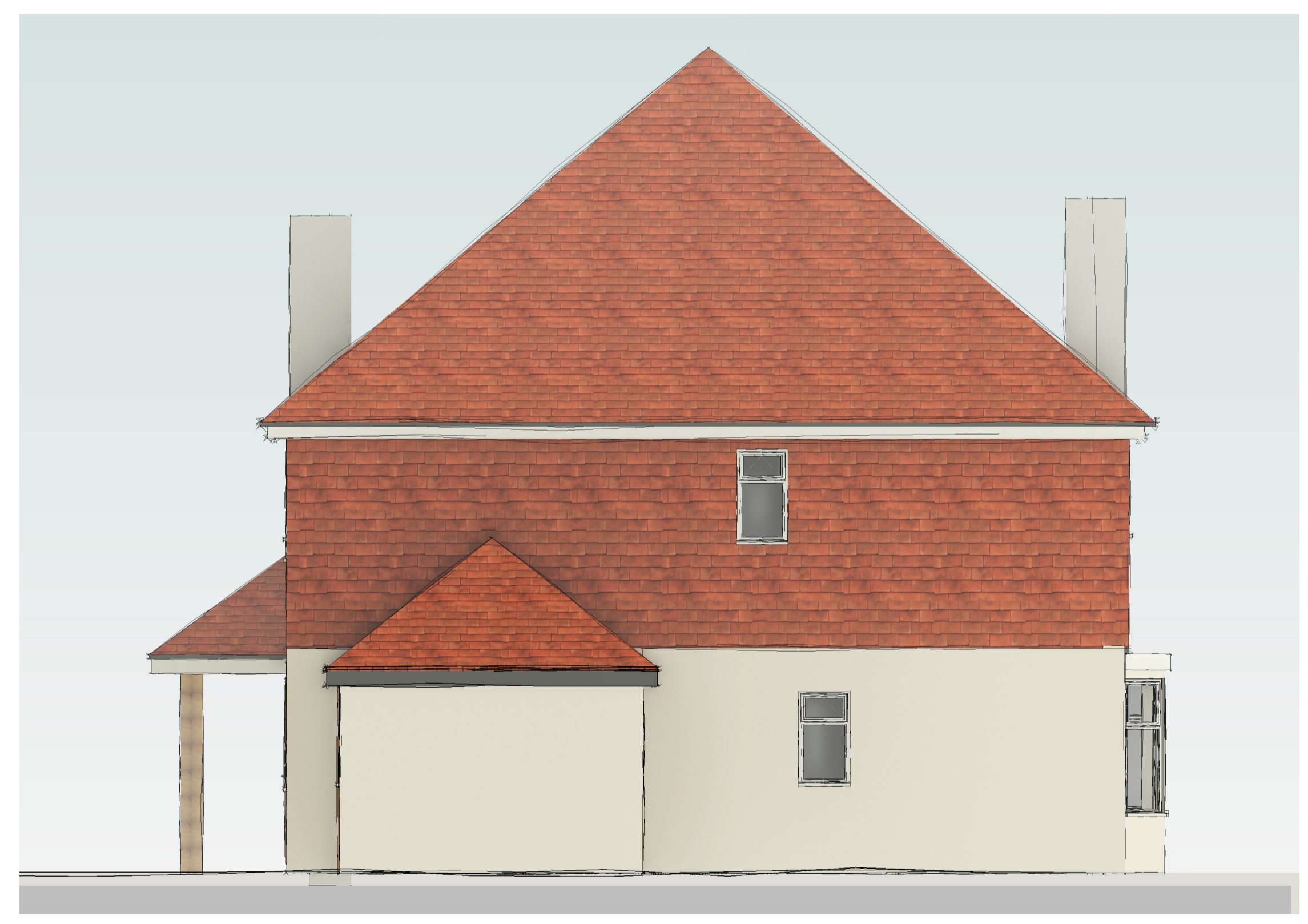
1 North- Existing 1 : 50