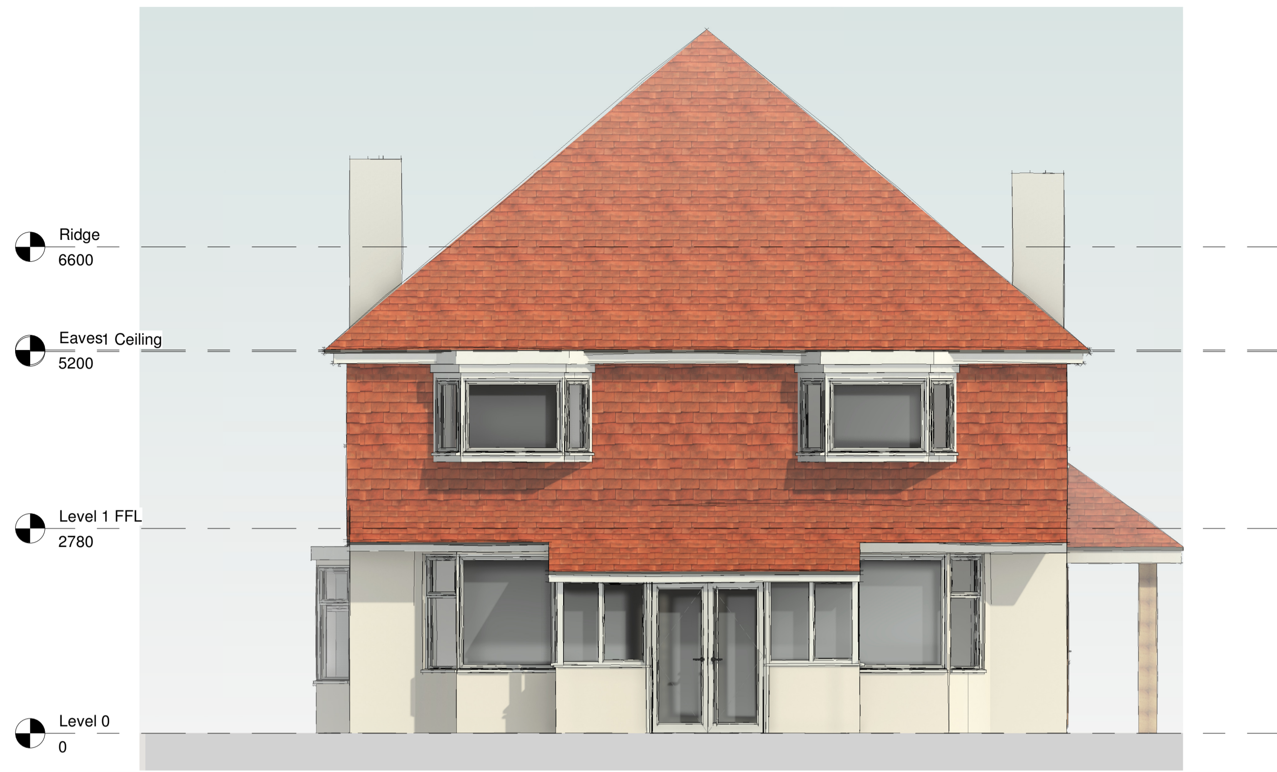
4 South.-Existing 1 : 50