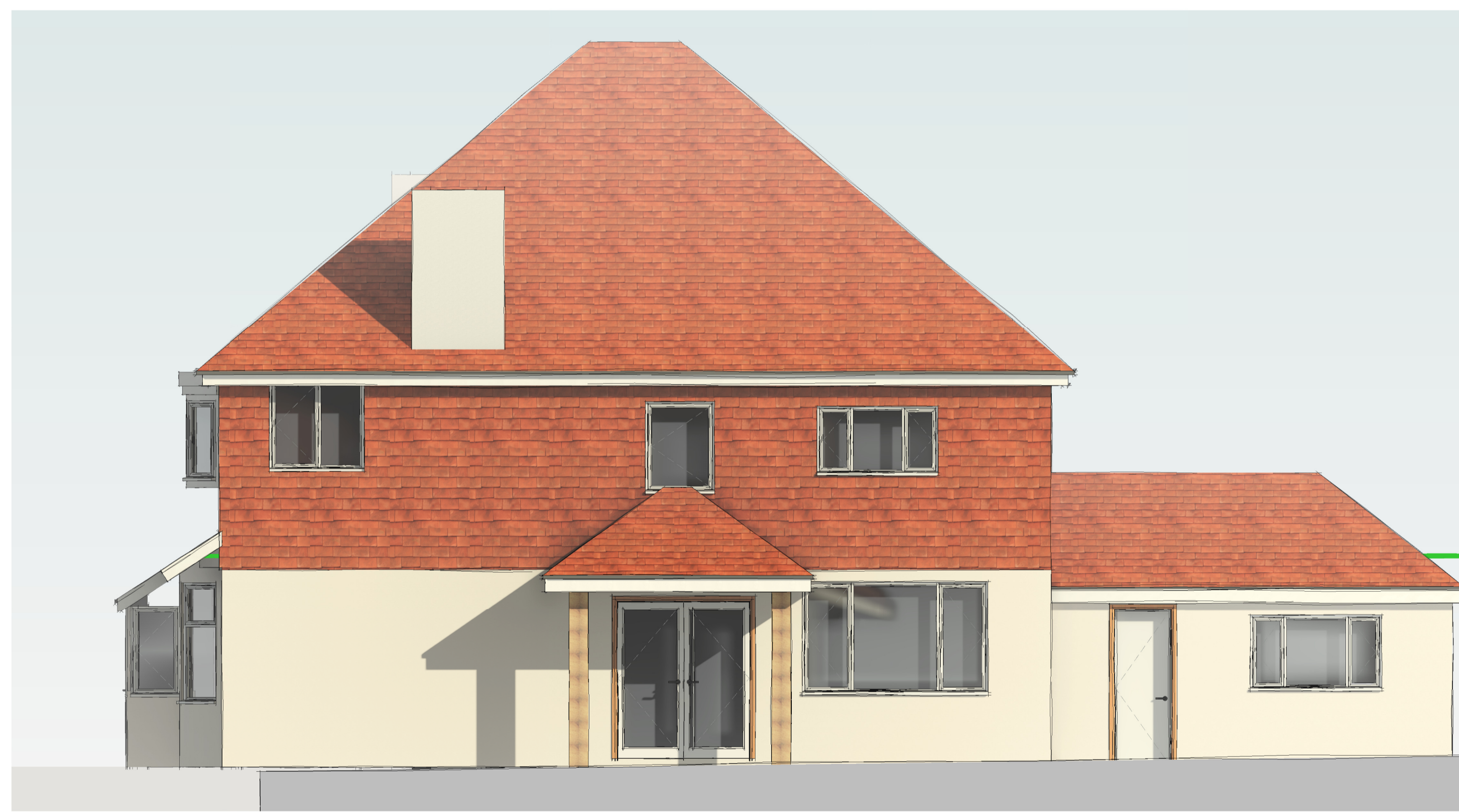
3 East-Existing 1 : 50