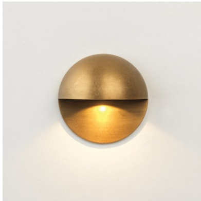
Photo 1 – Proposed surface fixed wall style fitting with 2W 3000K warm white light in marine grade stainless steel finish – to be installed into the masonry retaining walls around the hard-standing parking area for safe pedestrian access and security.

The proposals are to remove the existing high-level general area halide floodlighting fixed to the driveway entrance and parking hard-standing area and to replace these with downward direction low-energy LED lighting for pedestrian areas to the perimeter of the hard-standing area as well as above the separate garage bay doors.