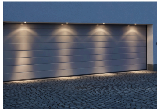
Photo 2 – Proposed recessed LED soffit downlights with 4000k warm white light in marine grade stainless steel finish – to be installed into the timber soffit 1 no. over each separate garage bay door for safe pedestrian access and security.