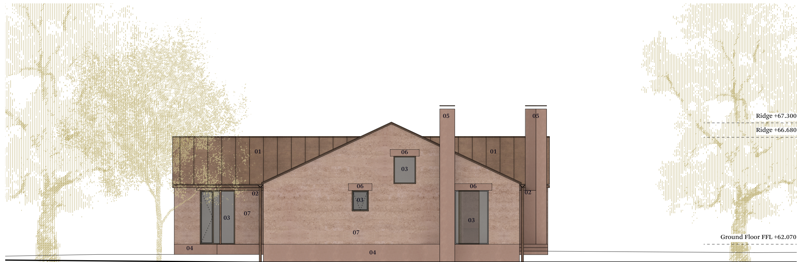
Proposed West Elevation