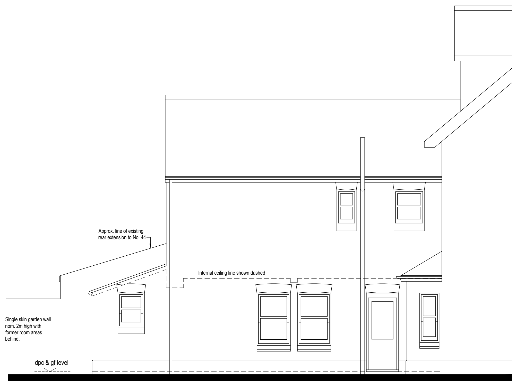
Part Side (South West) Elevation Facing Neighbour, No. 48 (As Existing) 1:50