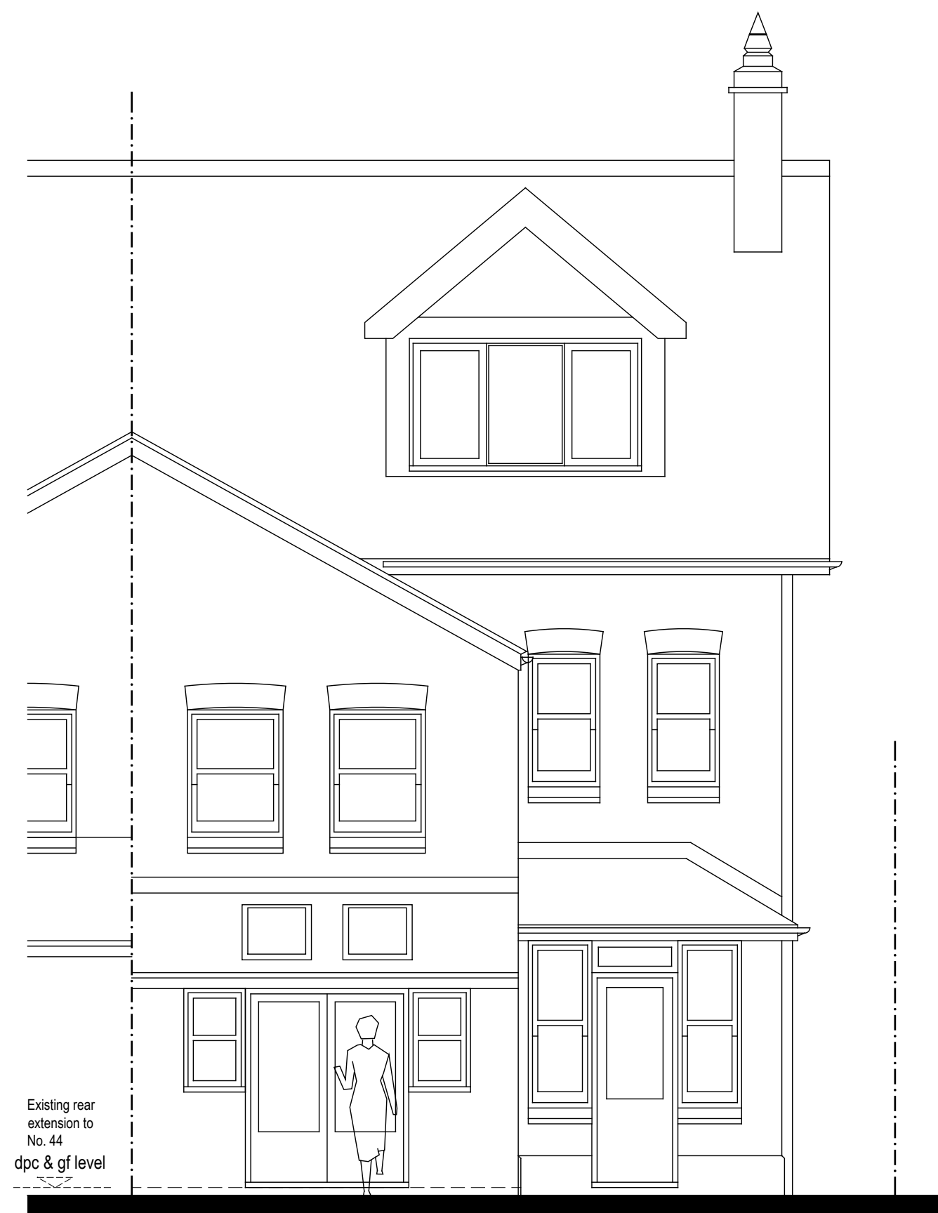
Rear (South East) Elevation Facing Property Rear Garden (As Existing) 1:50

Notes It is the responsibility of the person reading this drawing to establish that they are using the most current version including all other documents produced either by mda or by any other parties to the project. IF IN ANY DOUBT - ASK! No scaling permitted from this drawing. This drawing is copyright. ©