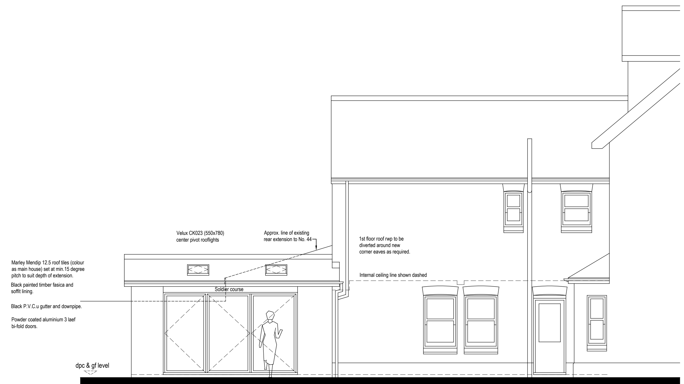
Part Side (South West) Elevation Facing Neighbour, No. 48 (As Proposed) 1:50