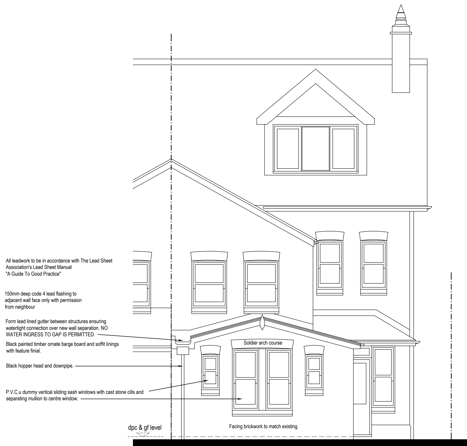
Rear (South East) Elevation Facing Property Rear Garden (As Proposed) 1:50

Notes It is the responsibility of the person reading this drawing to establish that they are using the most current version including all other documents produced either by mda or by any other parties to the project. IF IN ANY DOUBT - ASK! No scaling permitted from this drawing. This drawing is copyright. ©