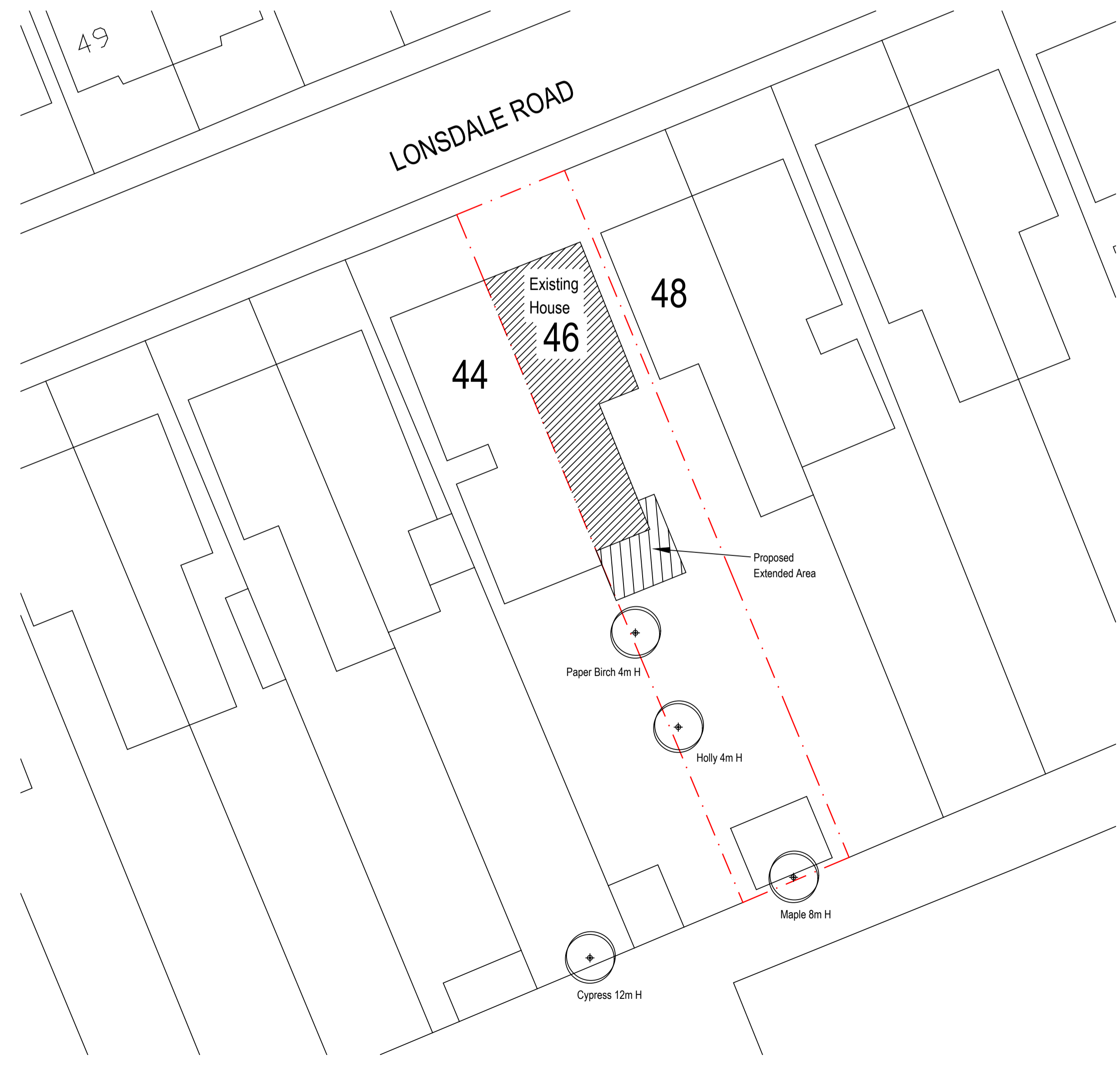
Block Plan As Proposed (1:200)