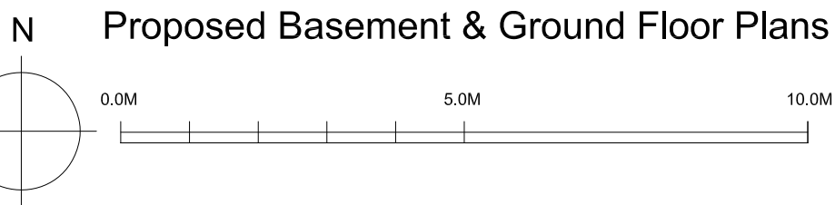
Proposed Basement & Ground Floor Plans

22.01.25 Rev C - Removal of GF3 & GF4 doorway - RADS shown 22.01.24 Rev B - REVISED LBC PLANS 16.11.23 Rev A SVP note added to GF.