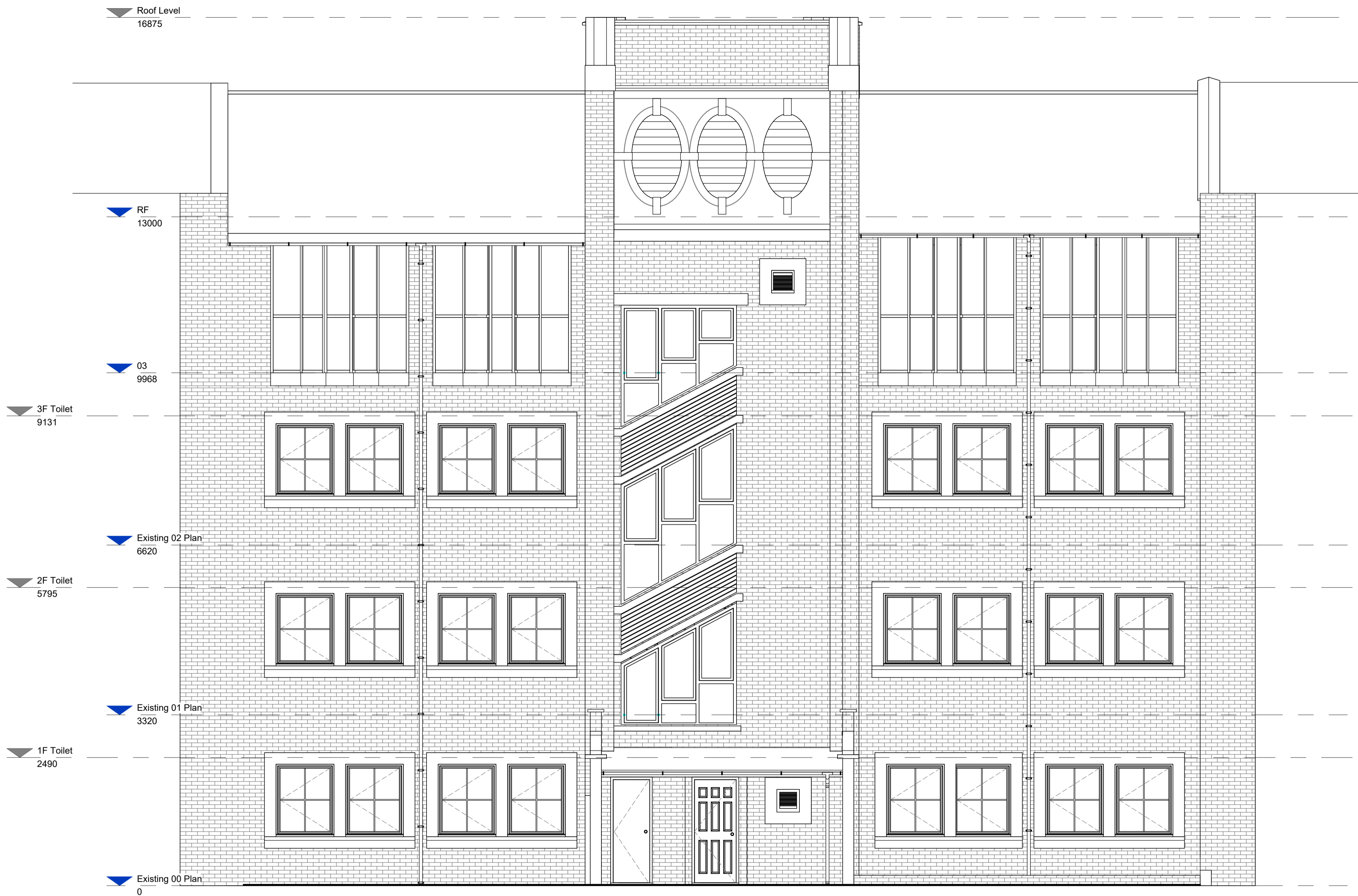
01 Existing External Elevation 01 1:50