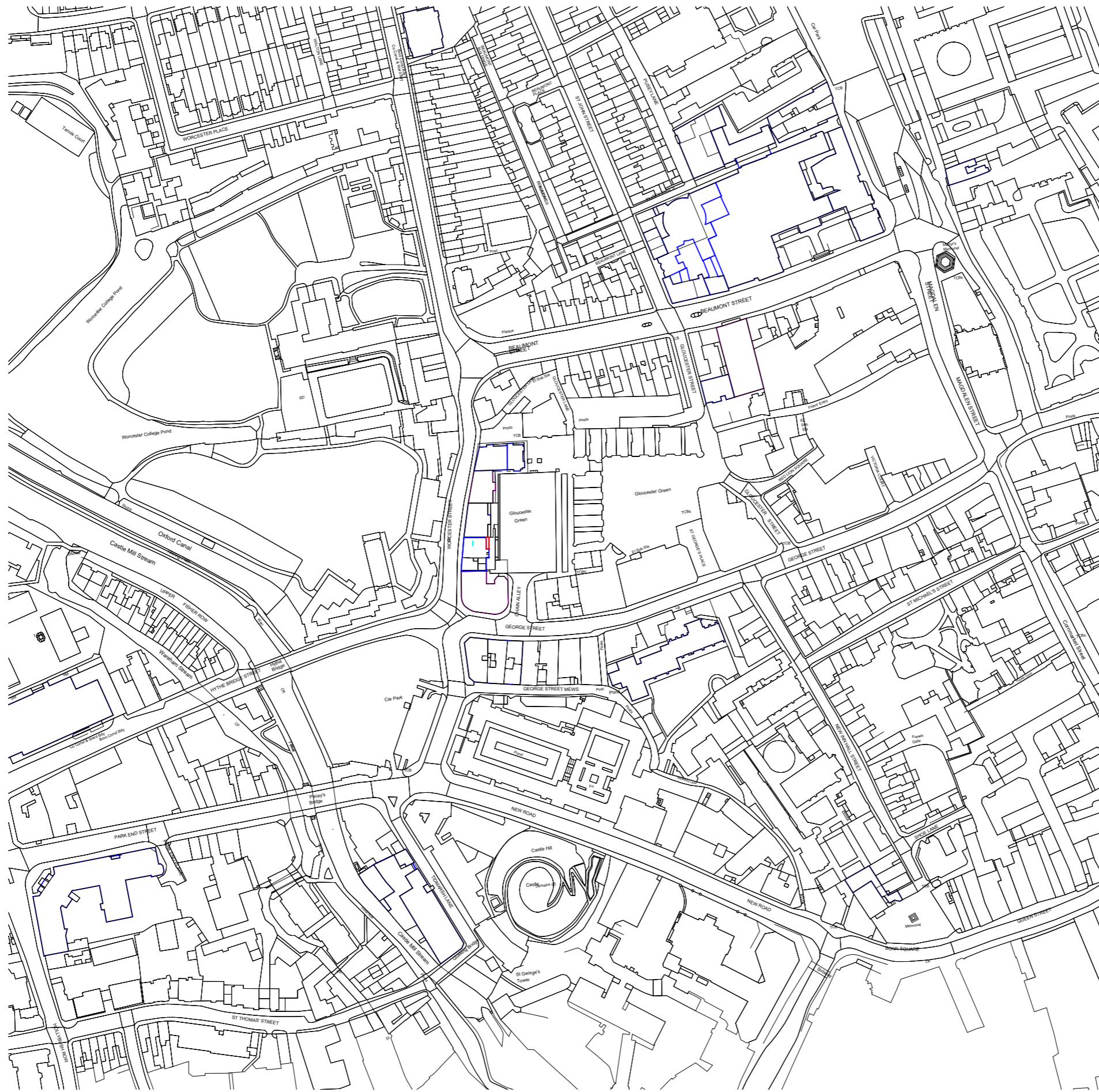
1 Location Plan 1:2500