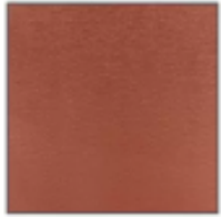
Copper Brown BSO4C39