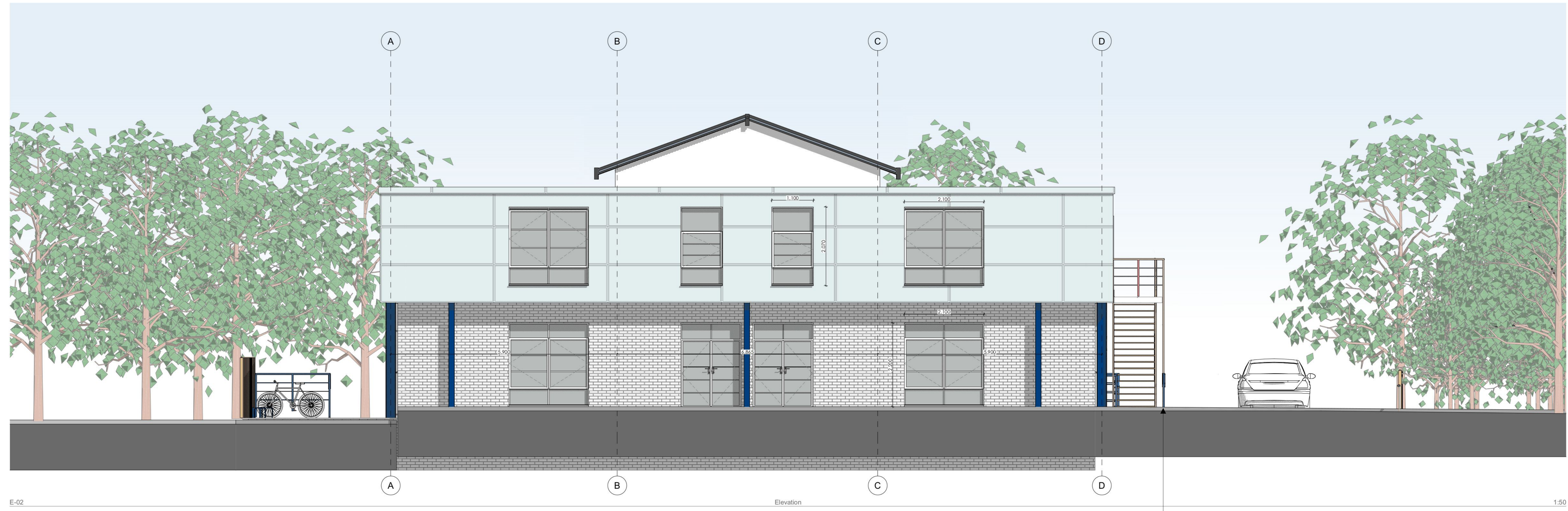
E-02 Elevation 1:50

Exterior staircase and landing to extend from the main building no farther than the existing ground floor handrails.