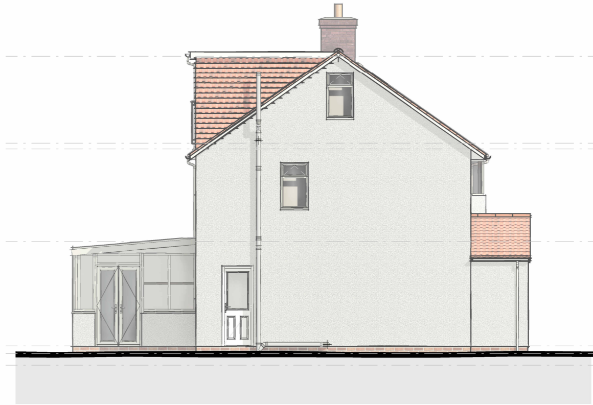
RS PRO. RIGHTSIDE ELEVATION SCALE 1 : 100