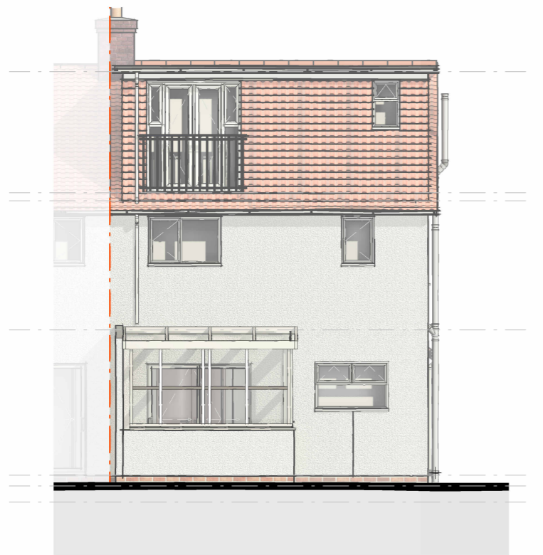
RE PRO. REAR ELEVATION SCALE 1 : 100