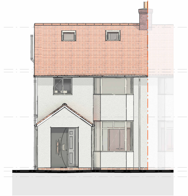
FE PRO. FRONT ELEVATION SCALE 1 : 100