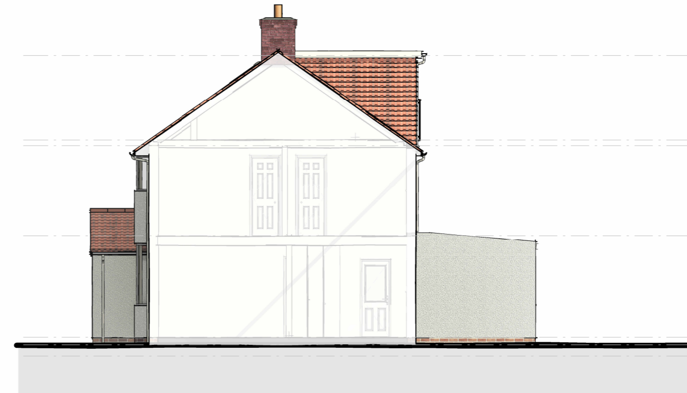
LS PRO. LEFTSIDE ELEVATION SCALE 1 : 100