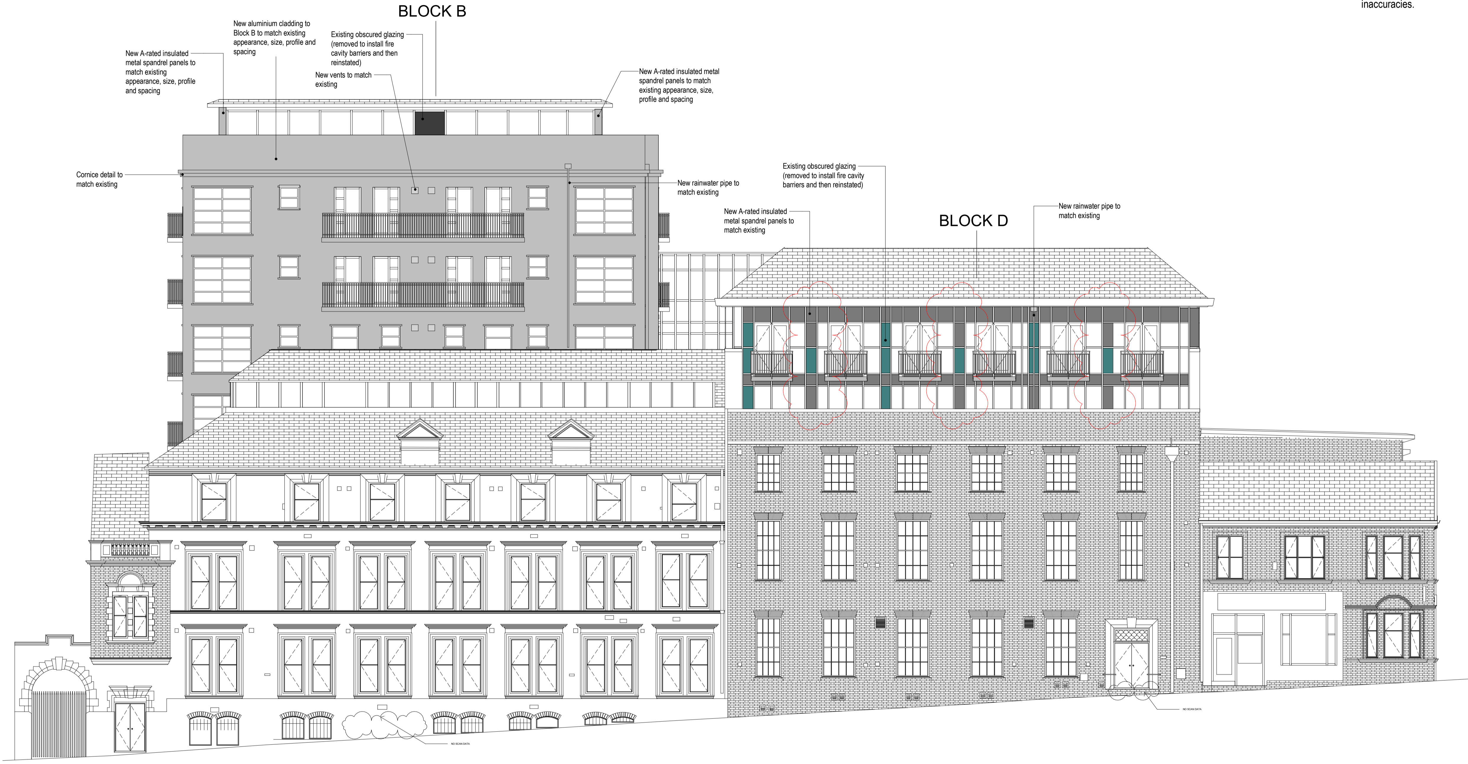
Proposed Elevation 3 1:100 @ A1