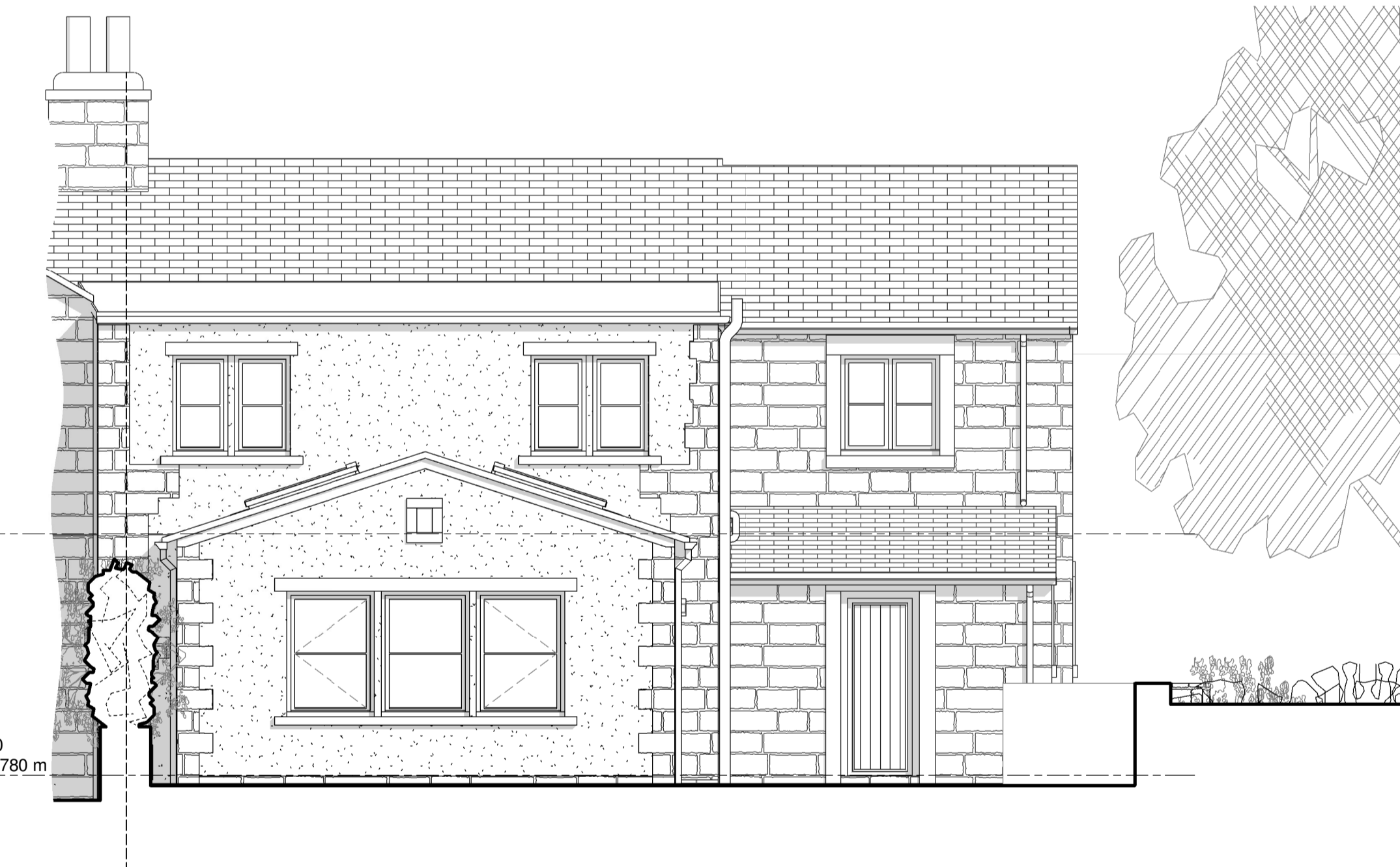
PROPOSED SOUTH GA ELEVATION 1 : 50