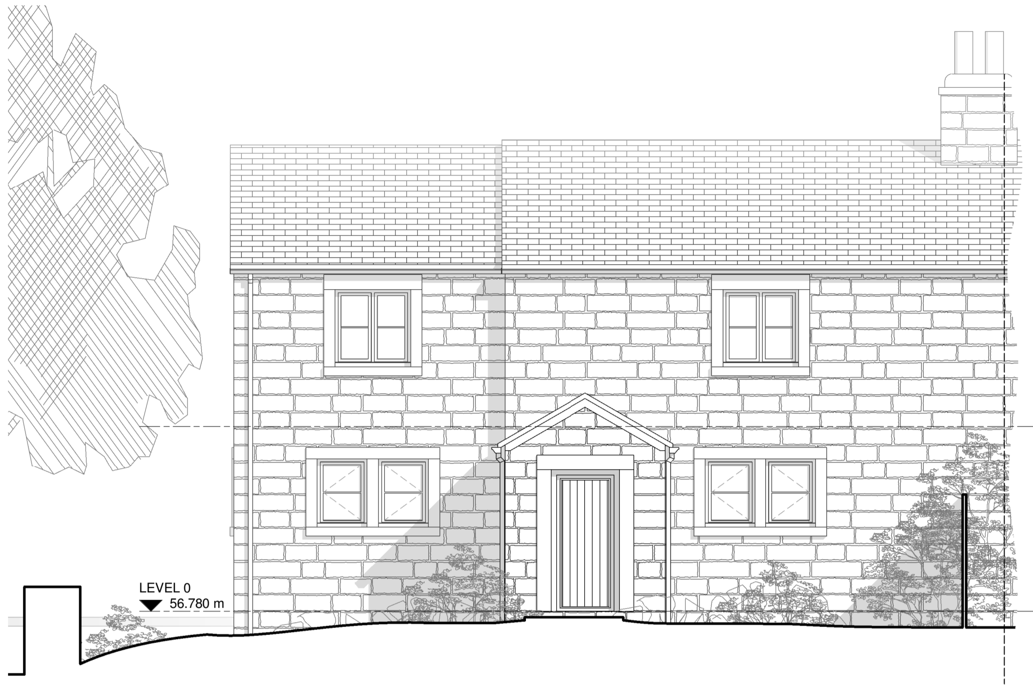
PROPOSED NORTH GA ELEVATION 1 : 50