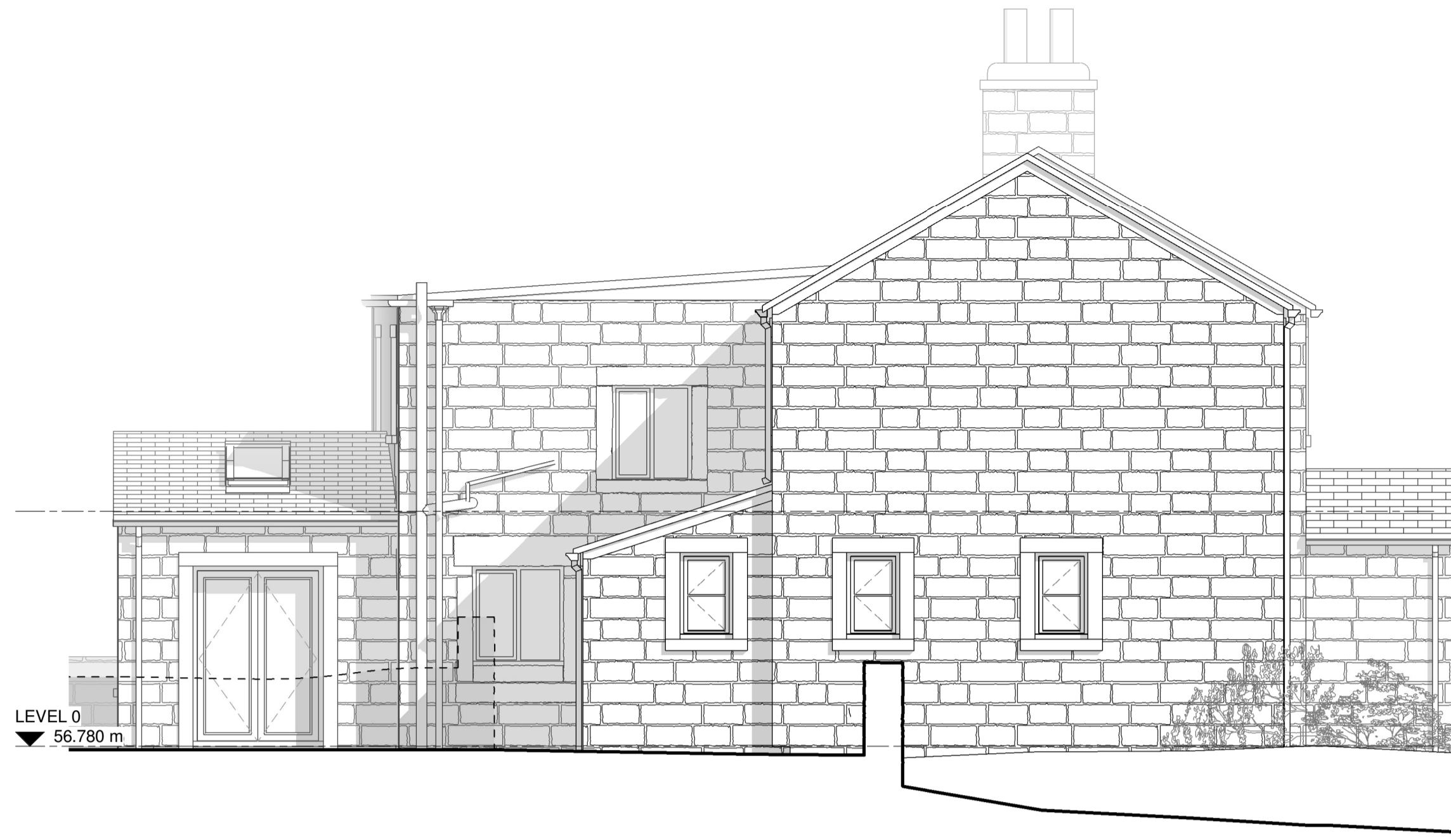
PROPOSED EAST GA ELEVATION 1 : 50