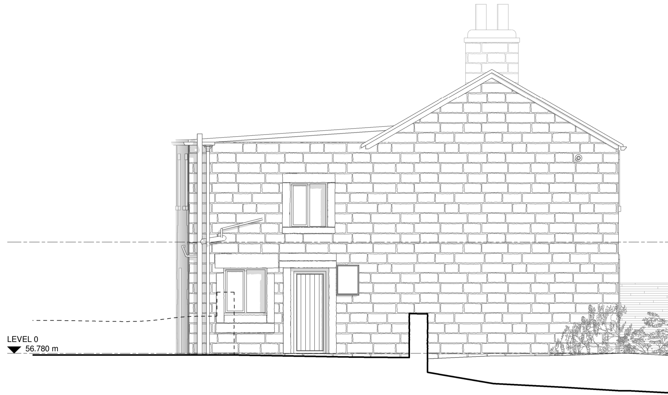
EXISTING EAST GA ELEVATION 1 : 50