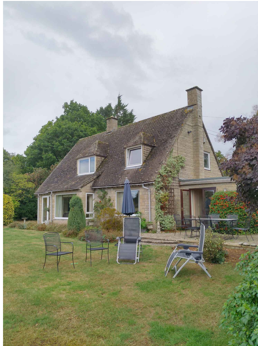
LOOKING TOWARDS SOUTH WEST ELEVATION