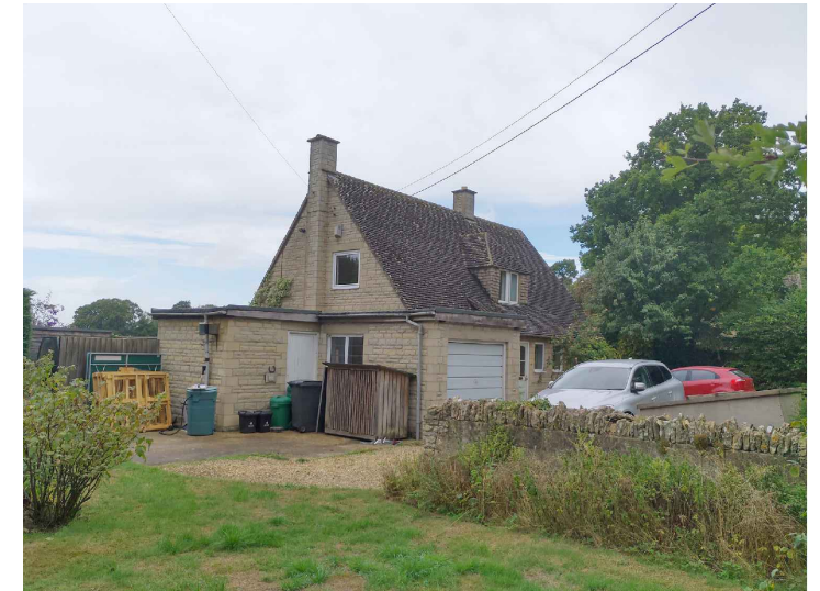
LOOKING TOWARDS NORTH / SOUTH EAST ELEVATIONS