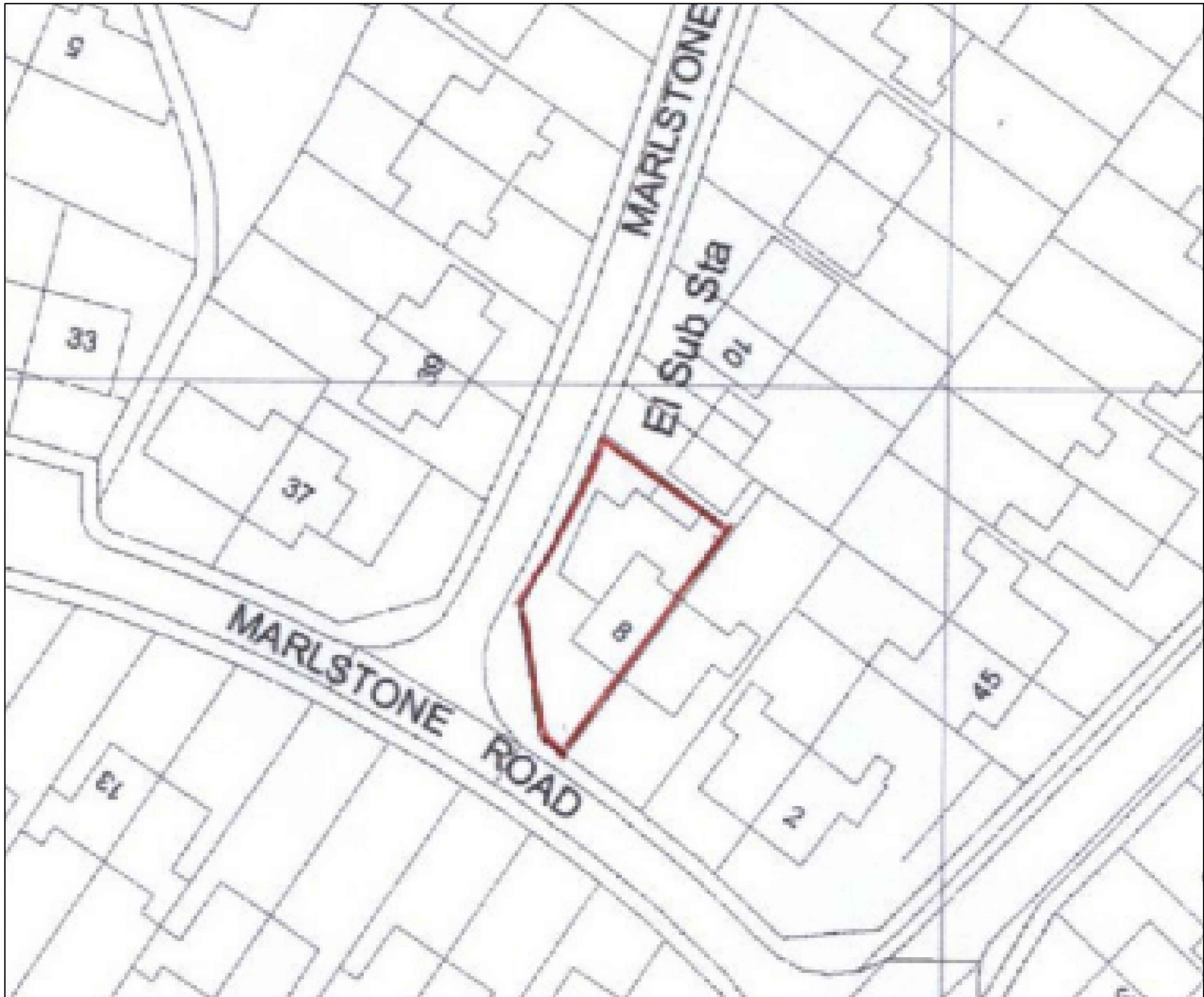
Block Plan Sc 1:500