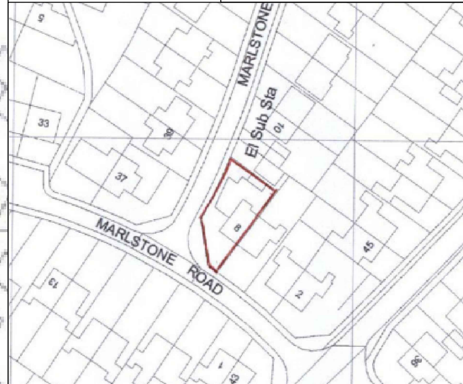
Area Plan Sc 1:1250

© THIS DRAWING AND THE BUILDING WORKS ILLUSTRATED ARE COPYRIGHT AND MAY NOT BE REPRODUCED WITHOUT WRITTEN PERMISSION