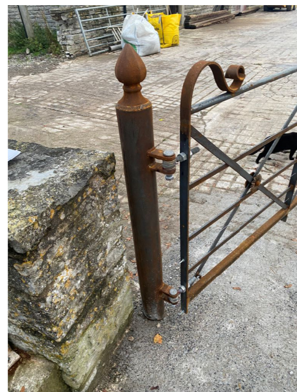
Photo - Gate Post