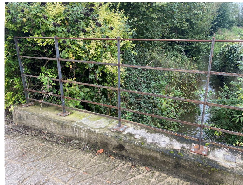
Photo - Estate Railings Elevation