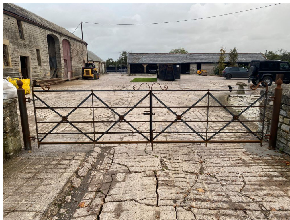
Photo - Gate Elevation