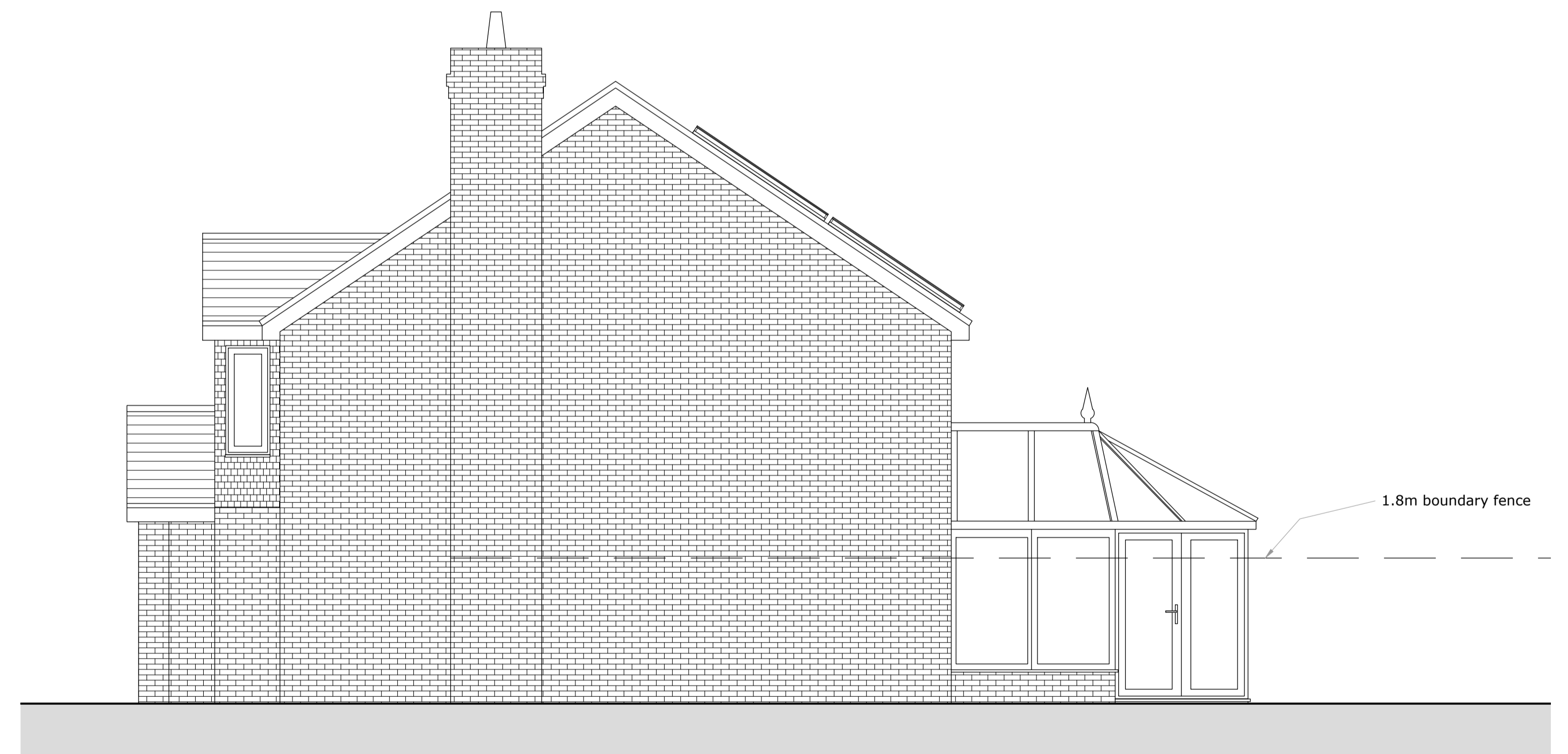
West Elevation as EXISTING 1:50