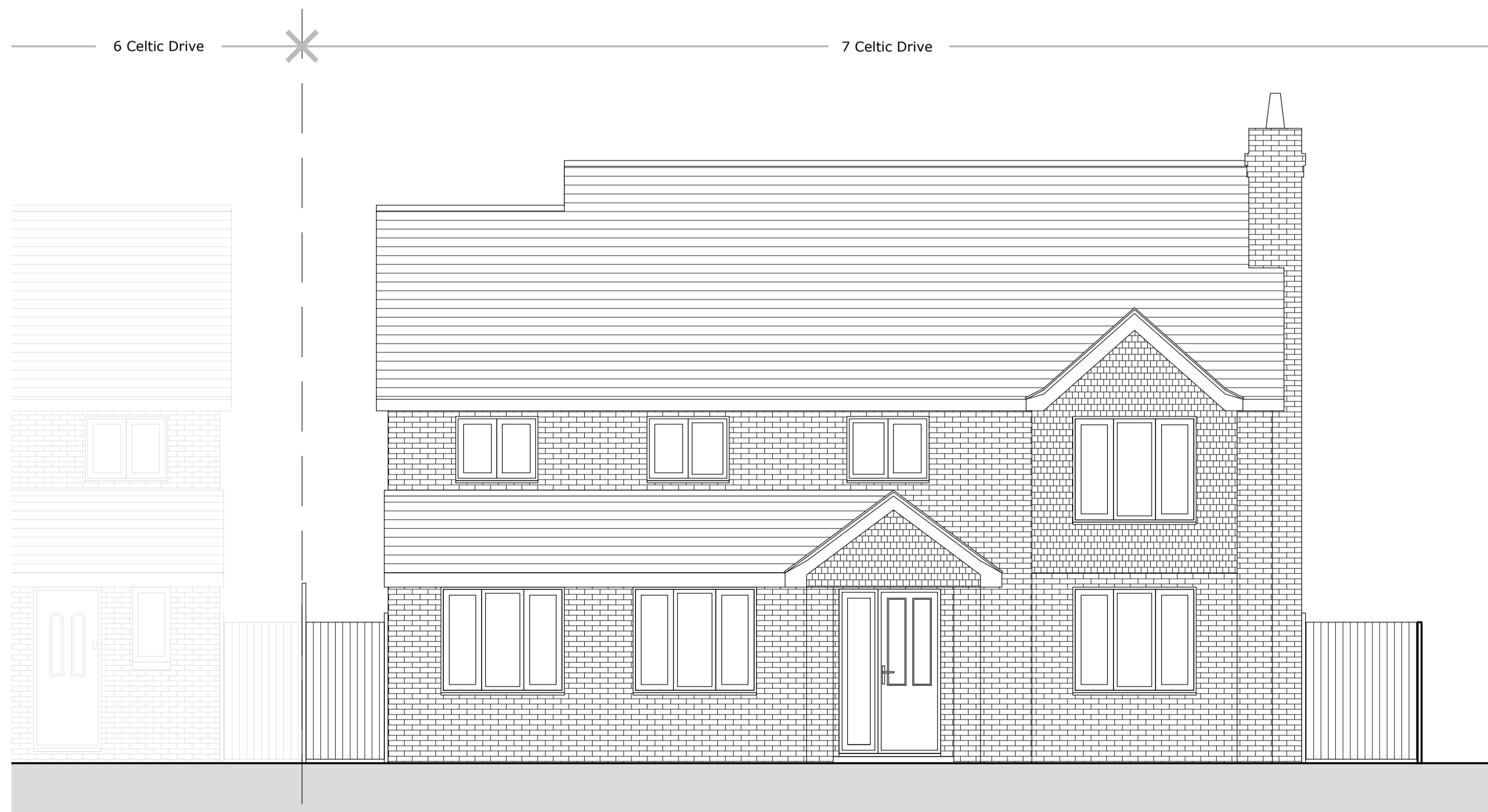
North Elevation as EXISTING 1:50