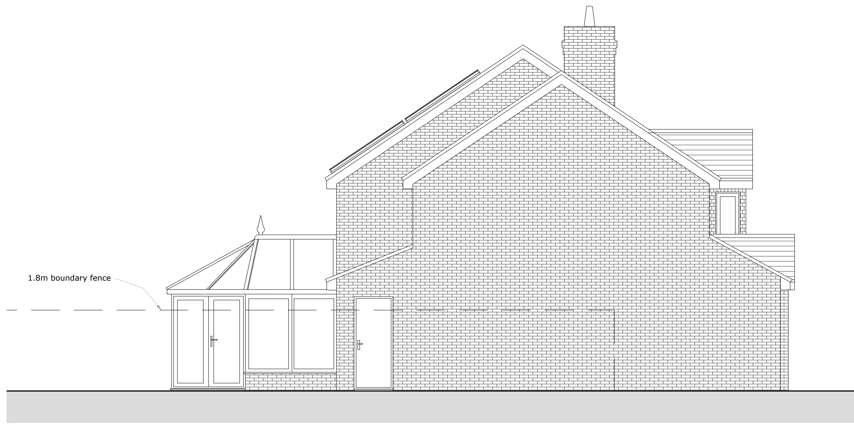
East Elevation as EXISTING 1:50