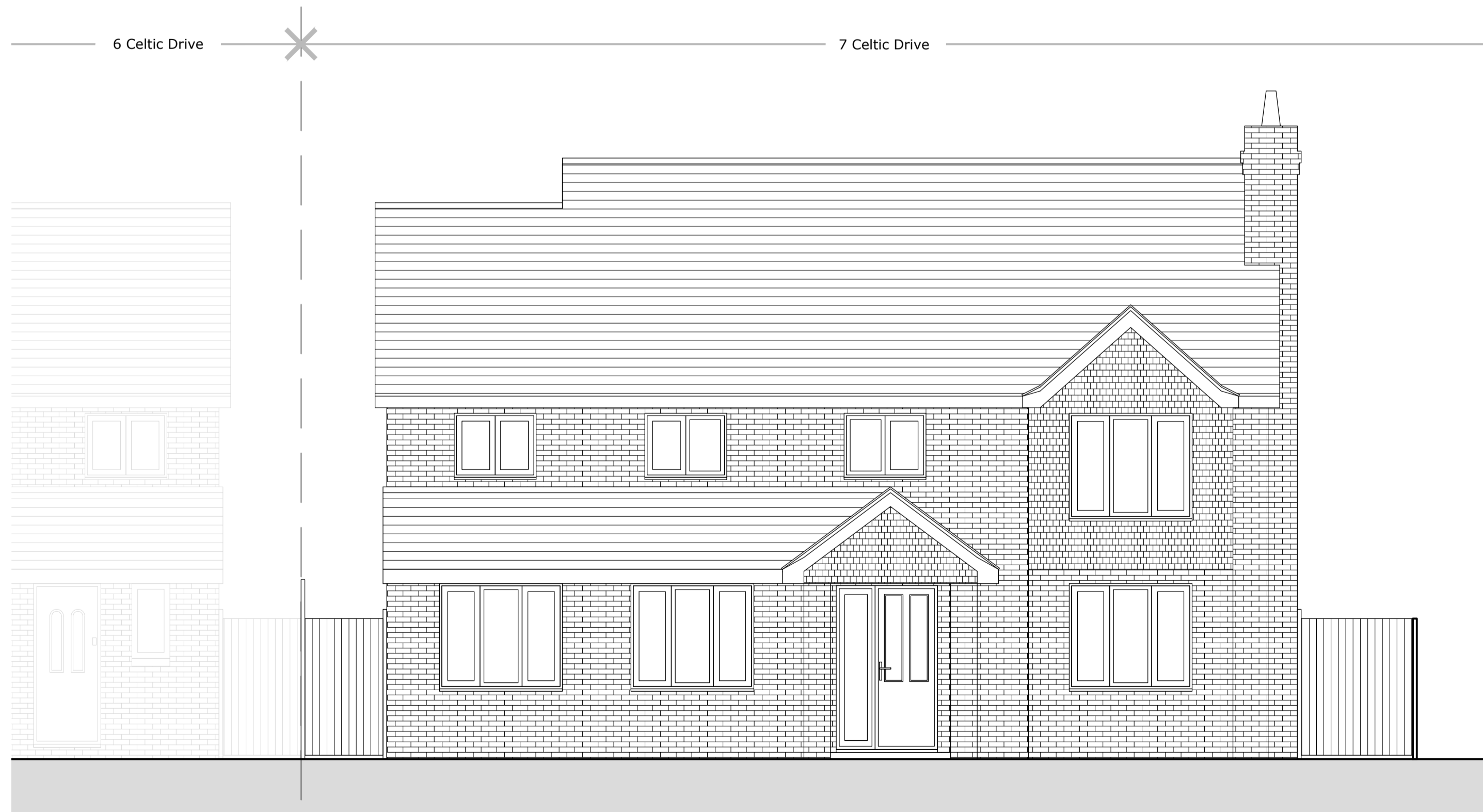
North Elevation as PROPOSED 1:50