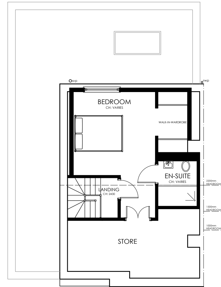
PROPOSED SECOND FLOOR PLAN 1:100