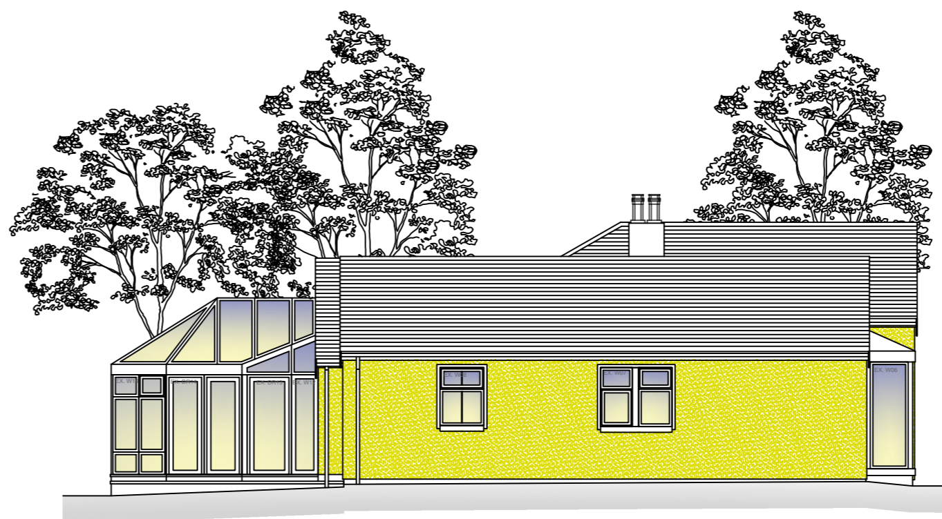
Existing Side Elevation (West) Scale 1:100