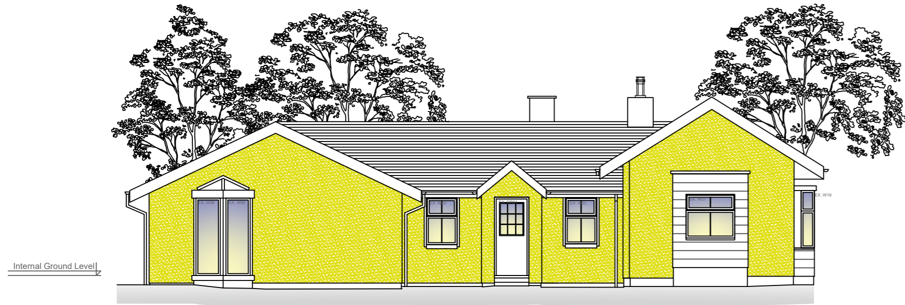
Existing Front Elevation (South) Scale 1:100

These drawings are to be read in conjunction with: AD 1719 / 01, BP01, 02, 04, 05, 06, 07 & 08