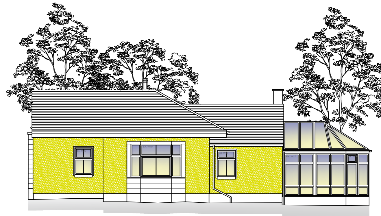
Existing Side Elevation (East) Scale 1:100