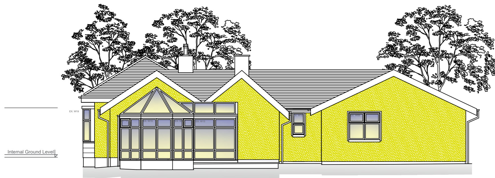
Existing Rear Elevation (North) Scale 1:100