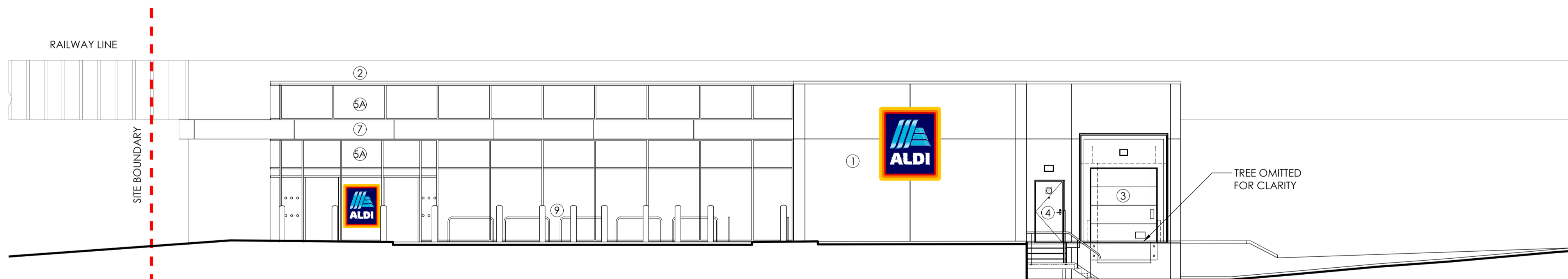
SOUTH WEST ELEVATION STORE ENTRANCE