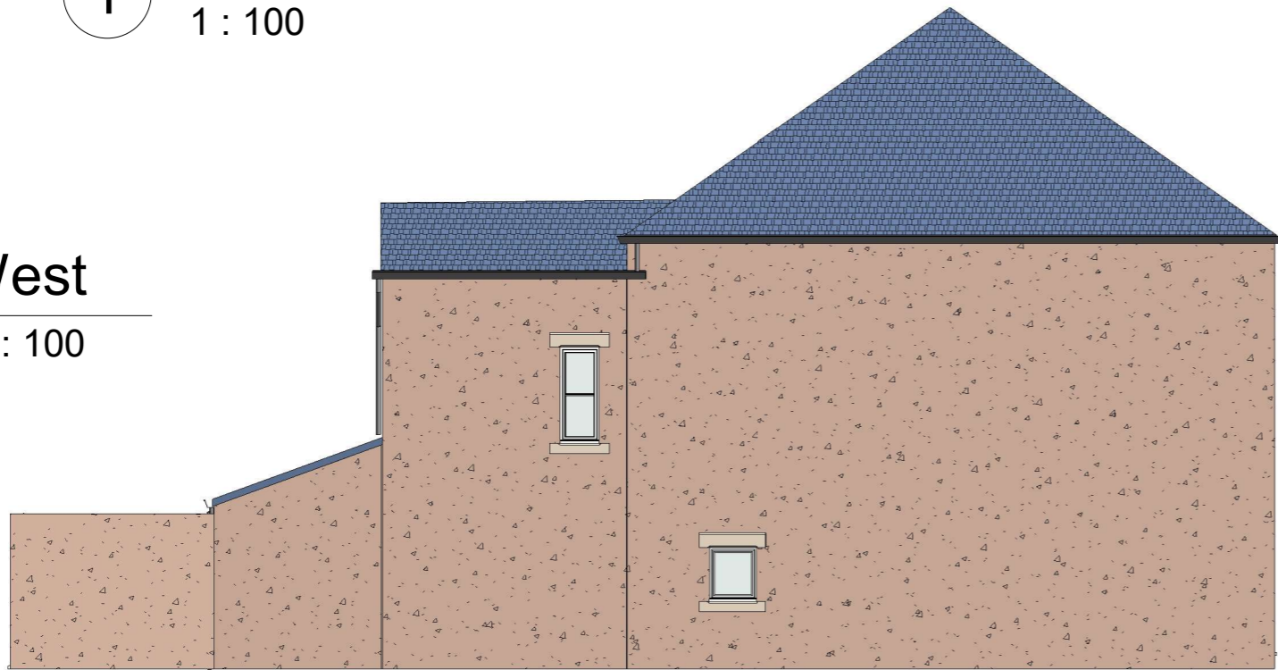
3 West 1 : 100