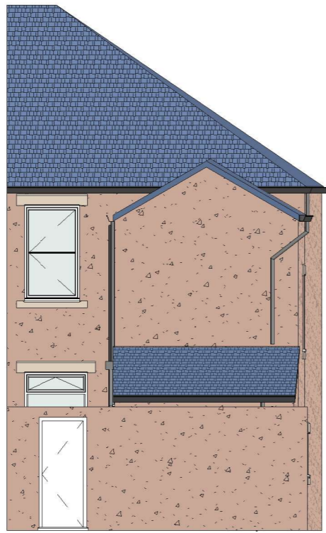
1 North 1 : 100