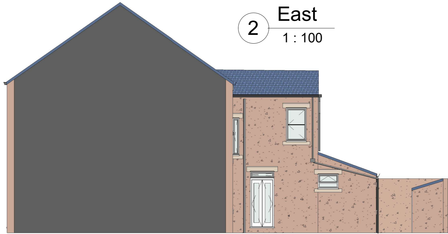
2 East 1 : 100