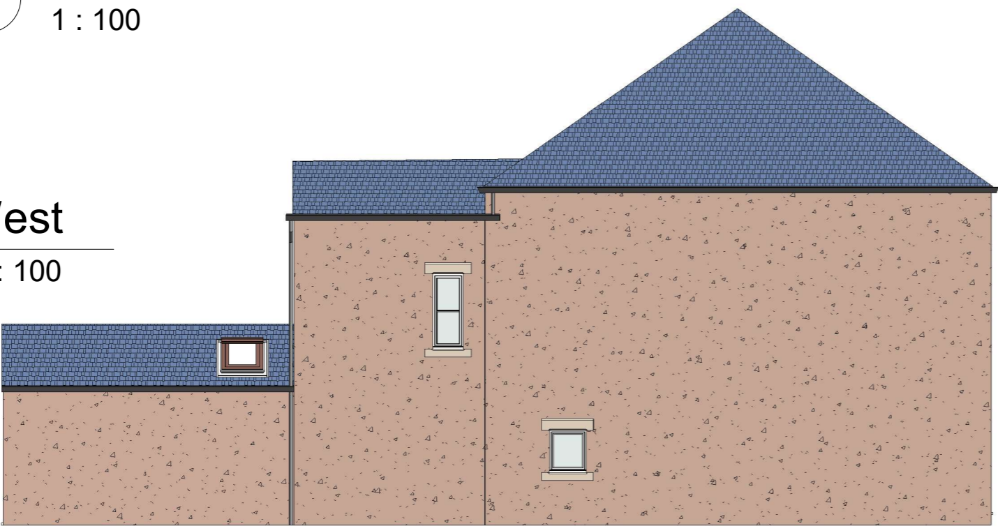
3 West 1 : 100

Remove existing door and supply and fit new window with artstone sill to match the existing.