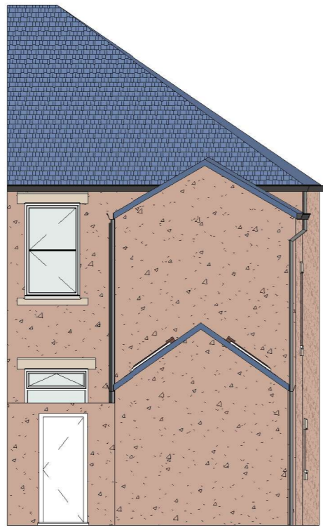
1 North 1 : 100