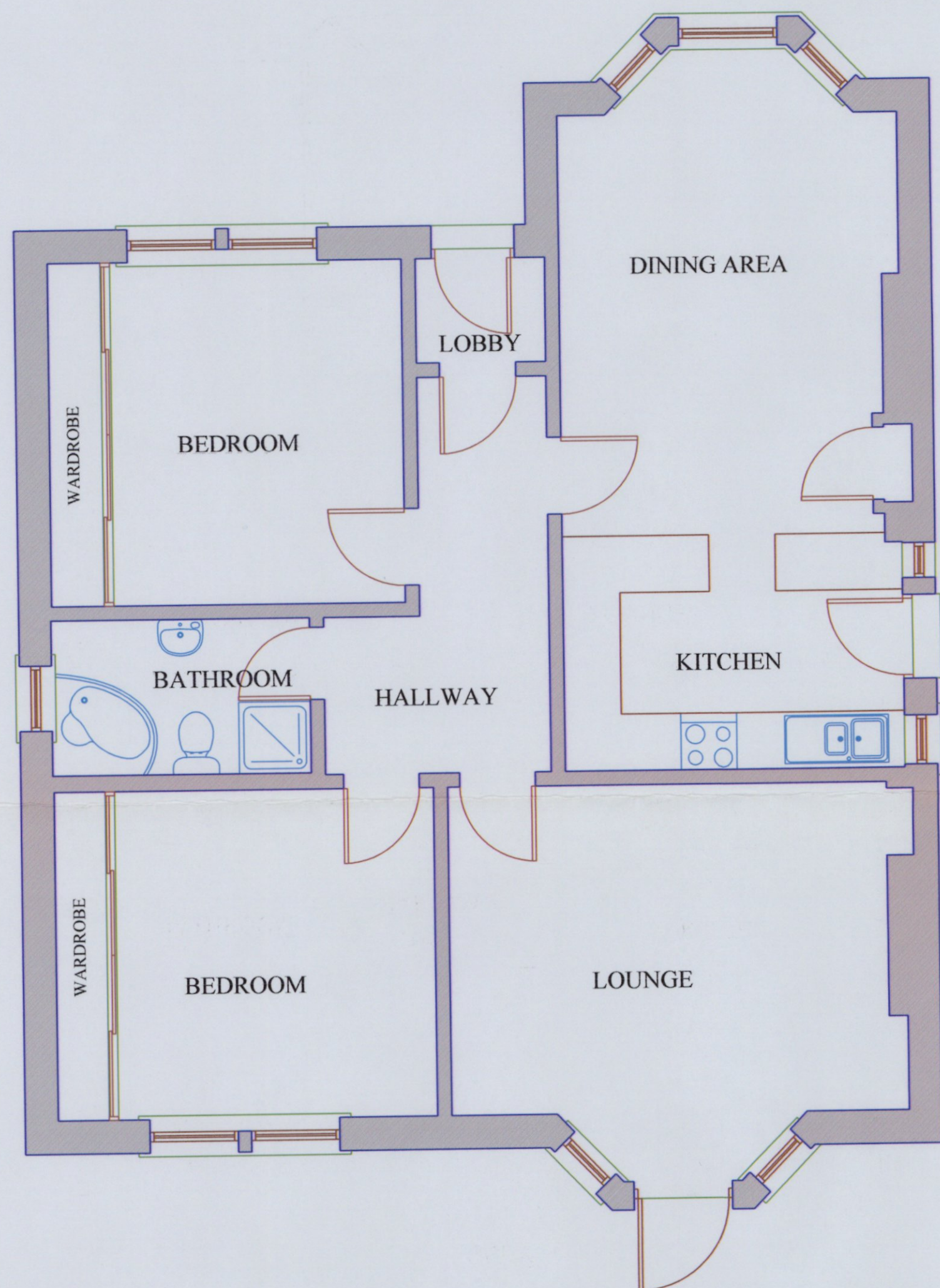
1:50 GROUND FLOOR PLAN AS EXISTING

No dimensions to be scaled from drawing. All dimensions to be checked on site. Any discrepancy to be notified immediately.