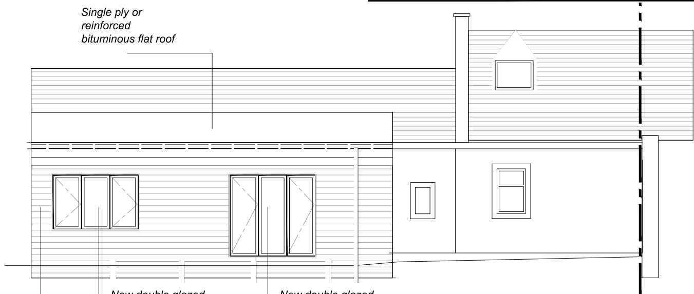
REAR (SOUTH) ELEVATION AS PROPOSED - SCALE 1:100