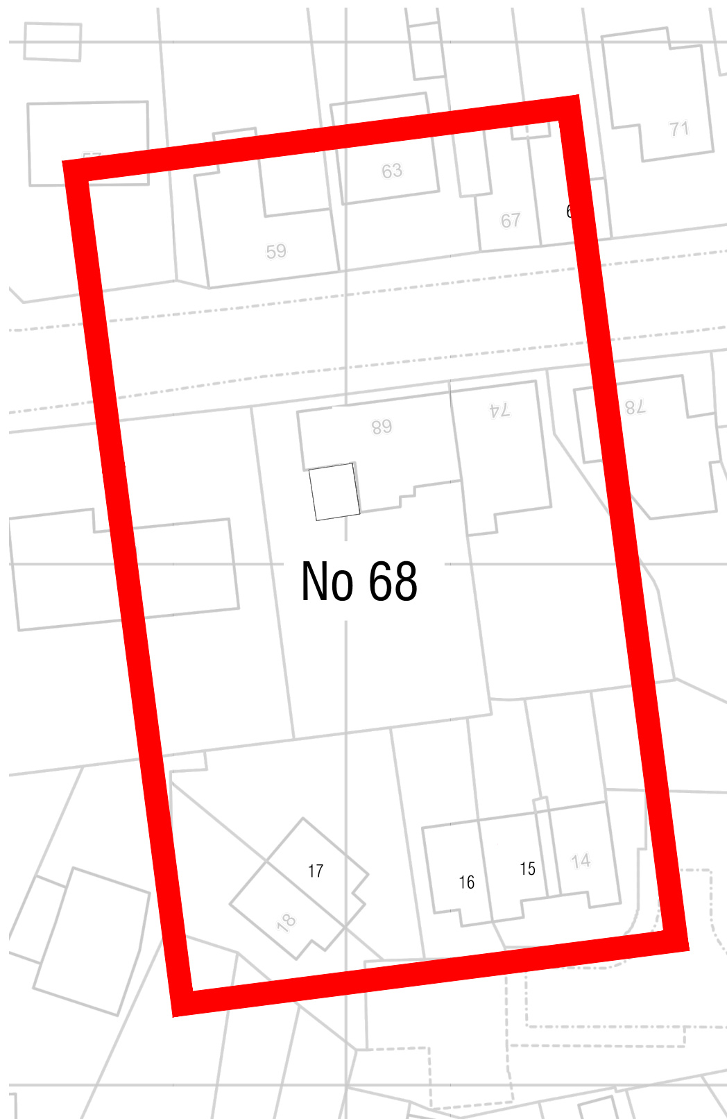
SITE PLAN 1:200 EXISTING