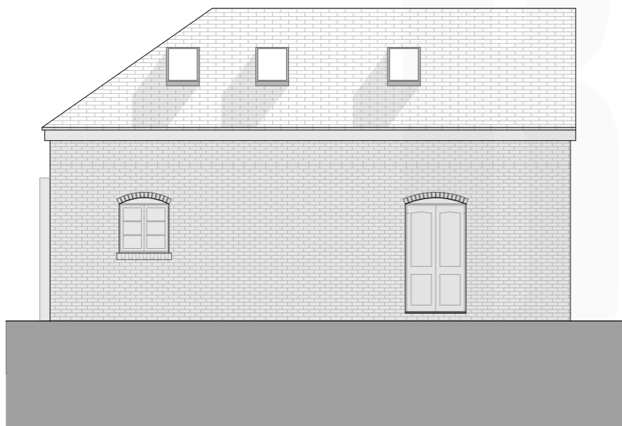
E3 Existing Rear Elevation 1:100