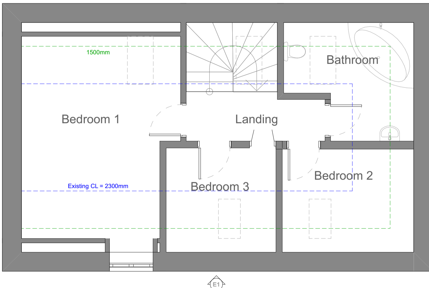
Existing First Floor Plan