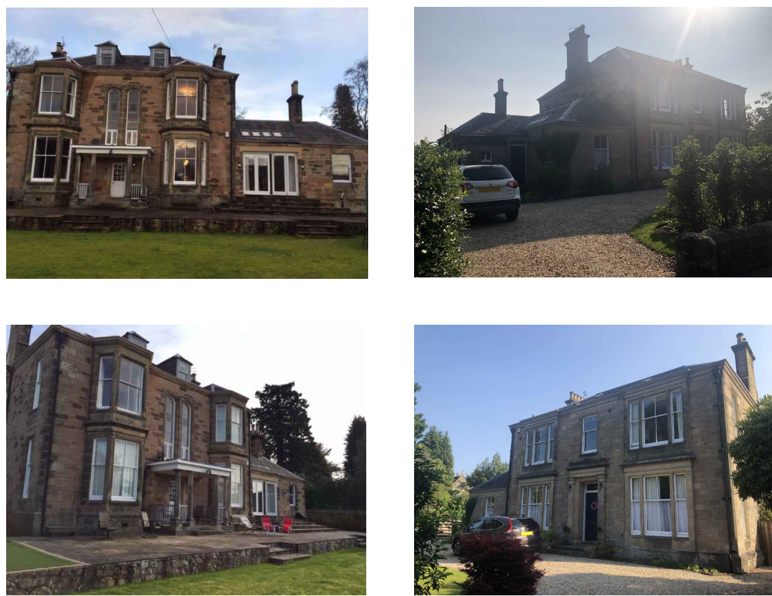
Existing House Photos