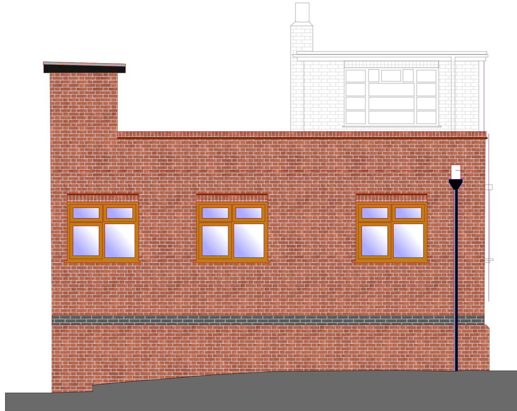
EXISTING SIDE (North, Driveway) Elevation 1:50