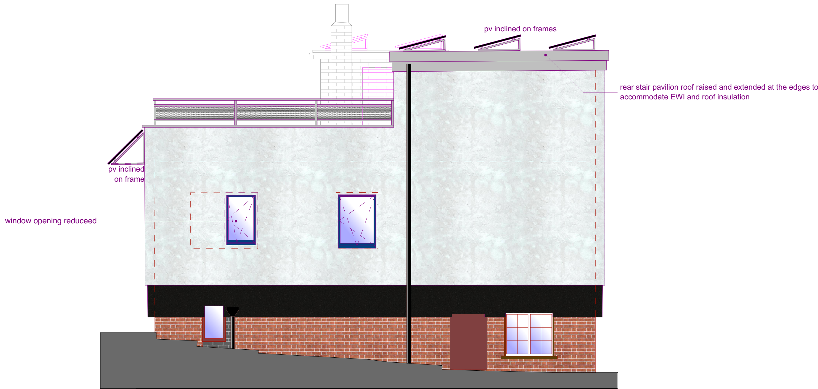
PROPOSED REAR (East) Elevation 1:50