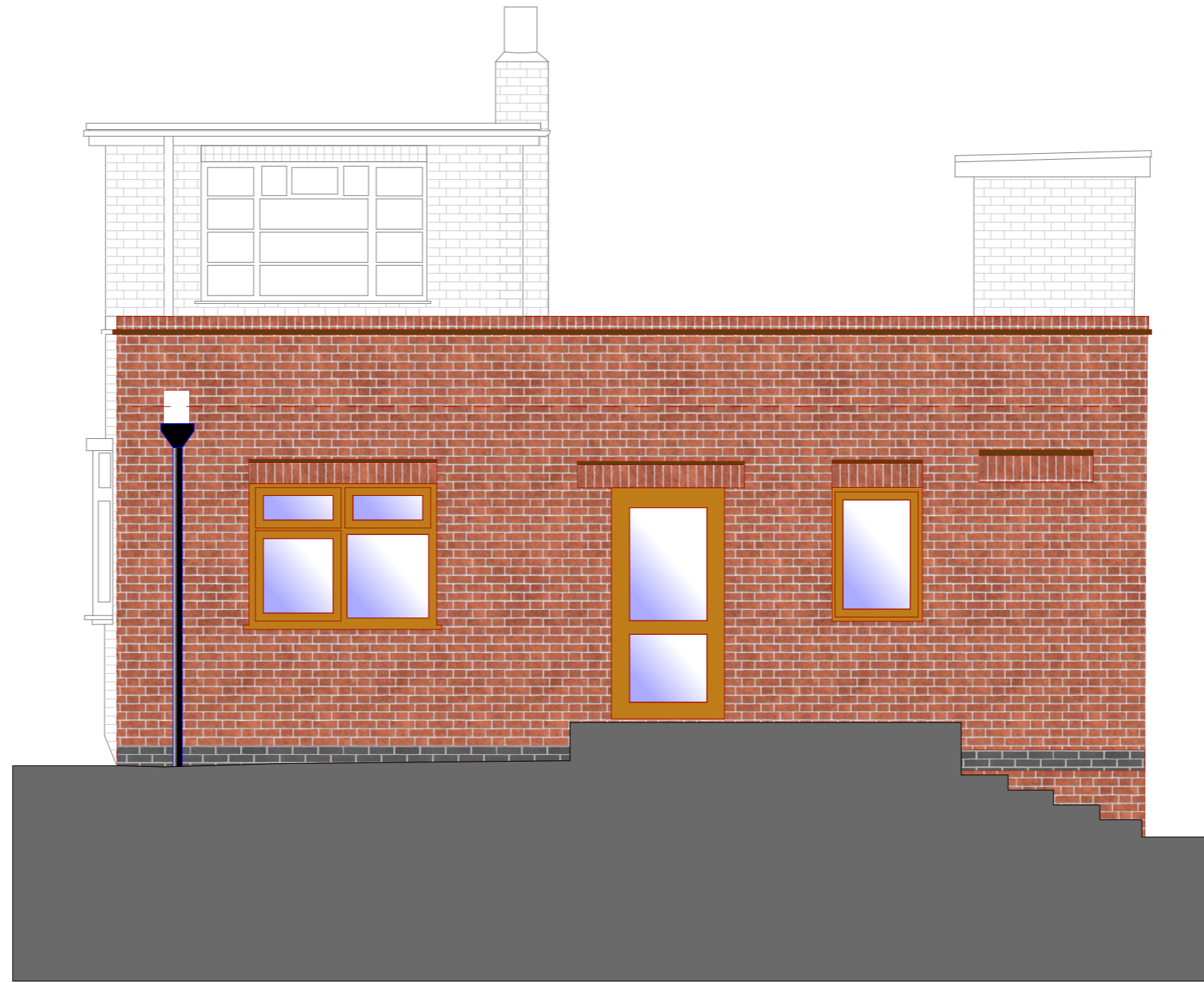
EXISTING SIDE (South) Elevation 1:50