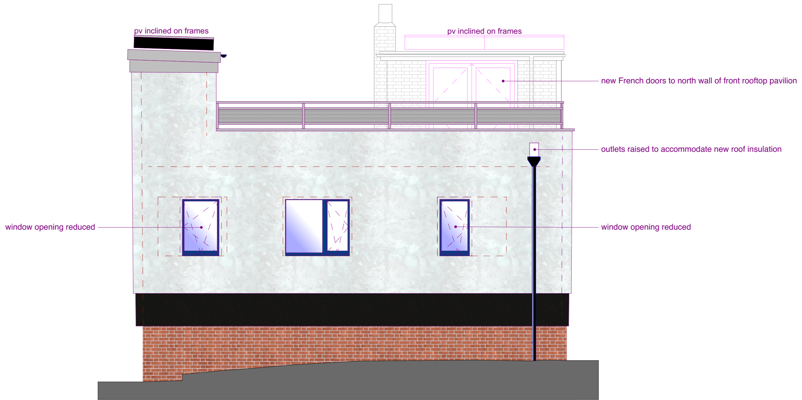
PROPOSED SIDE (North, Driveway) Elevation 1:50