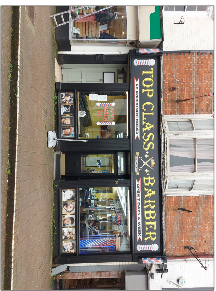
Sign / lighting in Place - NTS