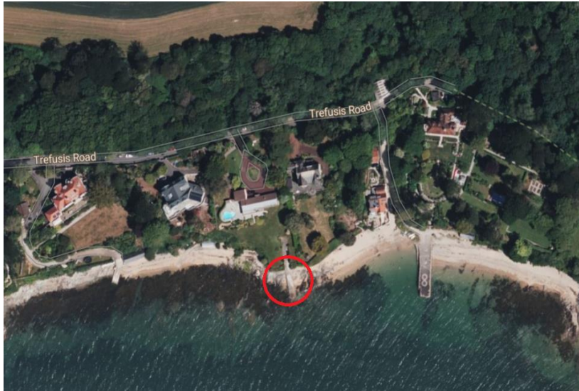
Figure 1: Aerial view of site, slipway location circled in red.