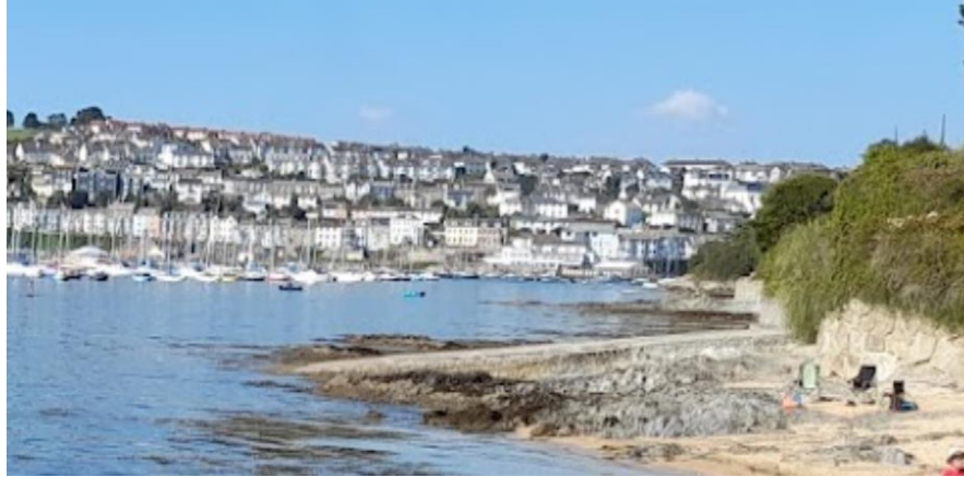
Figure 2: General Arrangement of current slipway