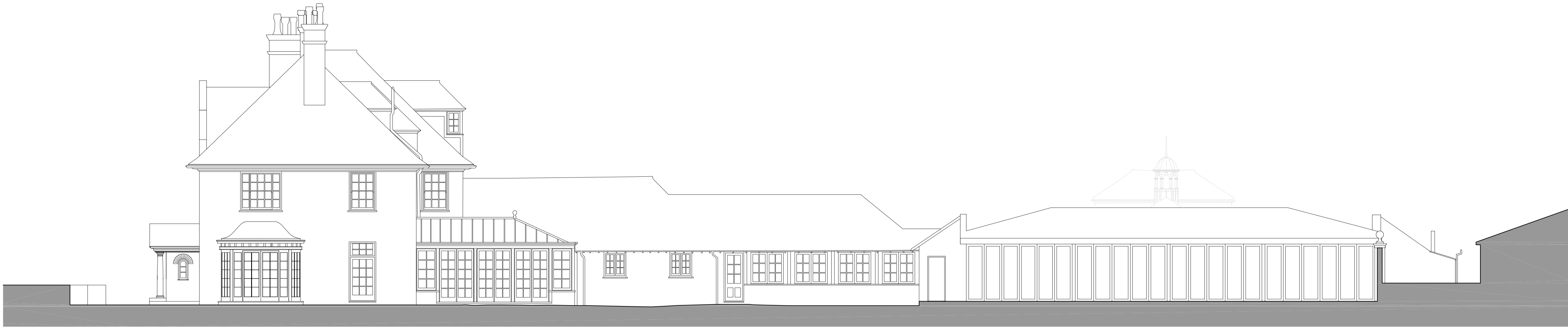
01 SOUTH ELEVATION - EXISTING HOUSE AND POOL 1:100