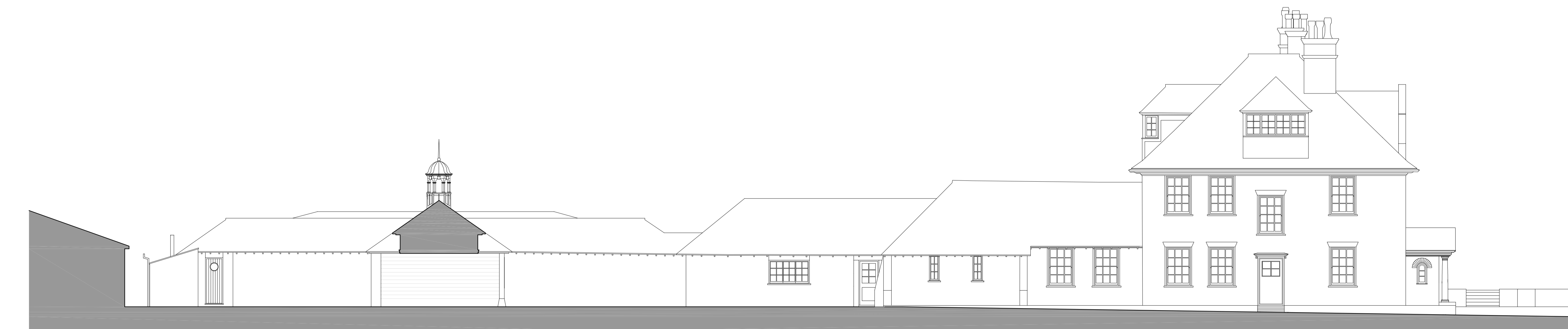
03 NORTH ELEVATION - EXISTING HOUSE 1:100