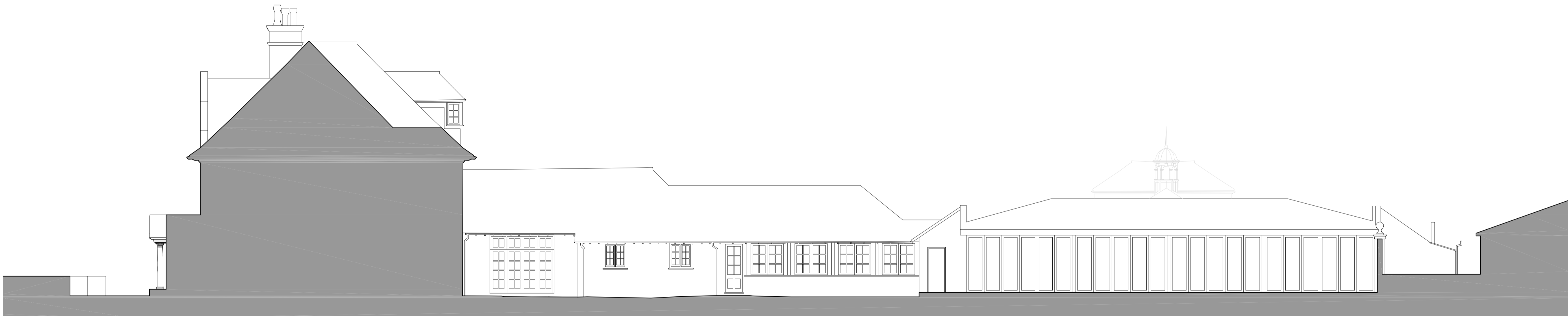
02 SOUTH ELEVATION - EXISTING HOUSE AND POOL 1:100